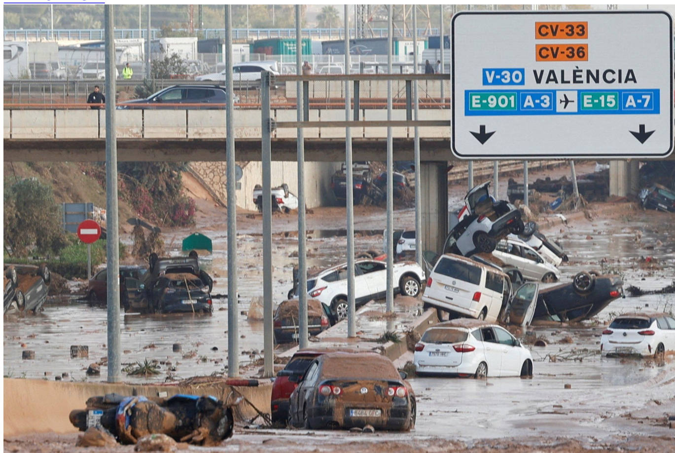
Cars were swept away by the force of water on Oct. 31, 2024, on a road on the outskirts of Valencia, Spain, where torrential rains caused flooding.