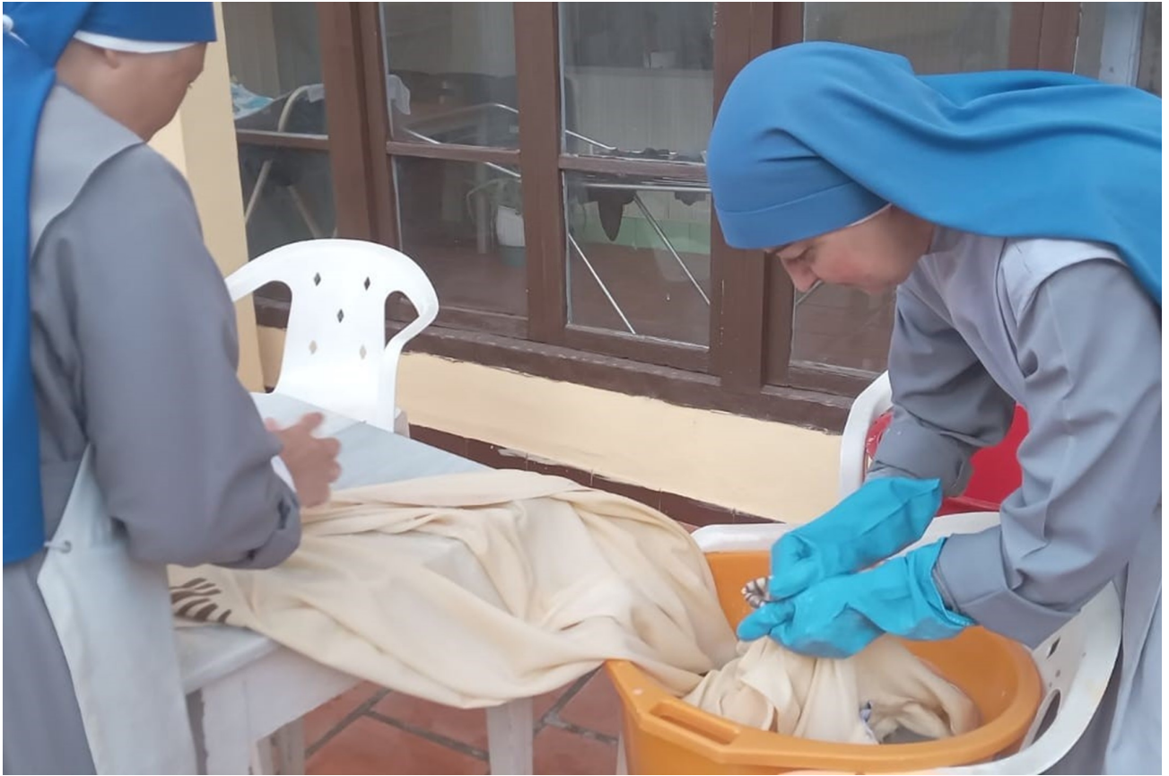
Contemplative sisters of the Religious Family of the Incarnate Word wash liturgical ornaments swept away by the rains.