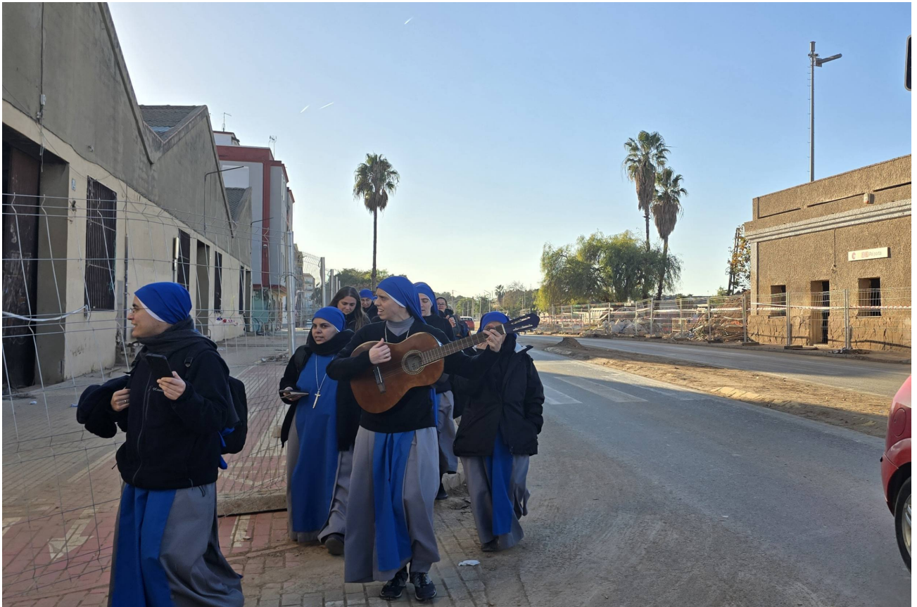
Nuns and volunteers bring the joy of the birth of Jesus to those affected by the DANA.