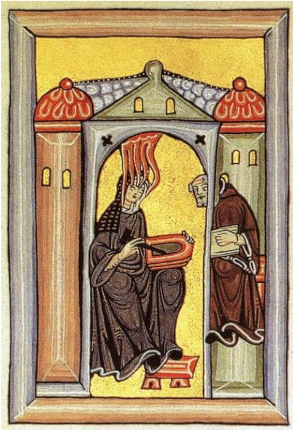
Hildegard von Bingen.

"They're relatively unappreciated," she told GSR. "Certainly, they haven't been displayed as a group before."