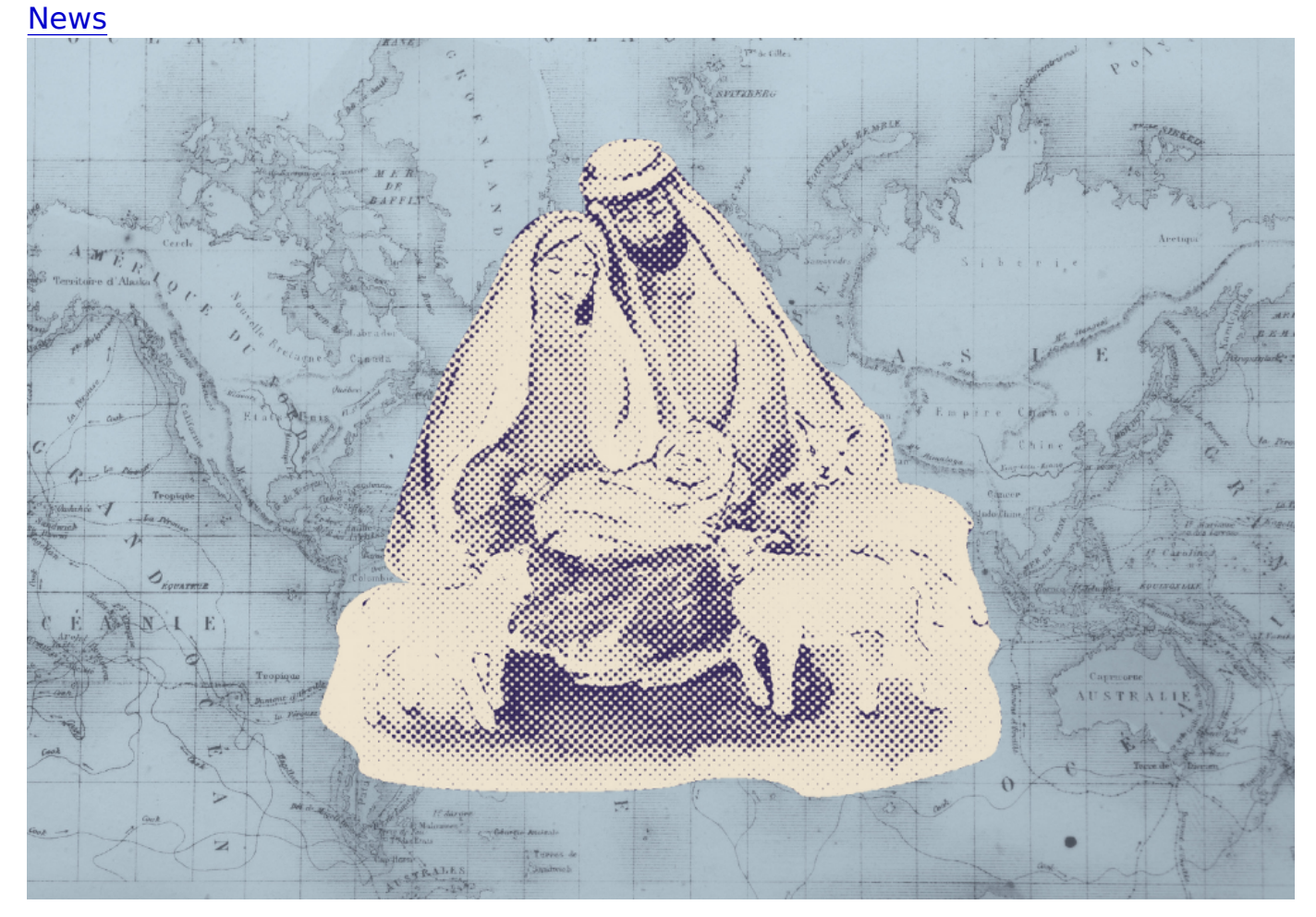
(GSR illustration/Olivia Bardo)