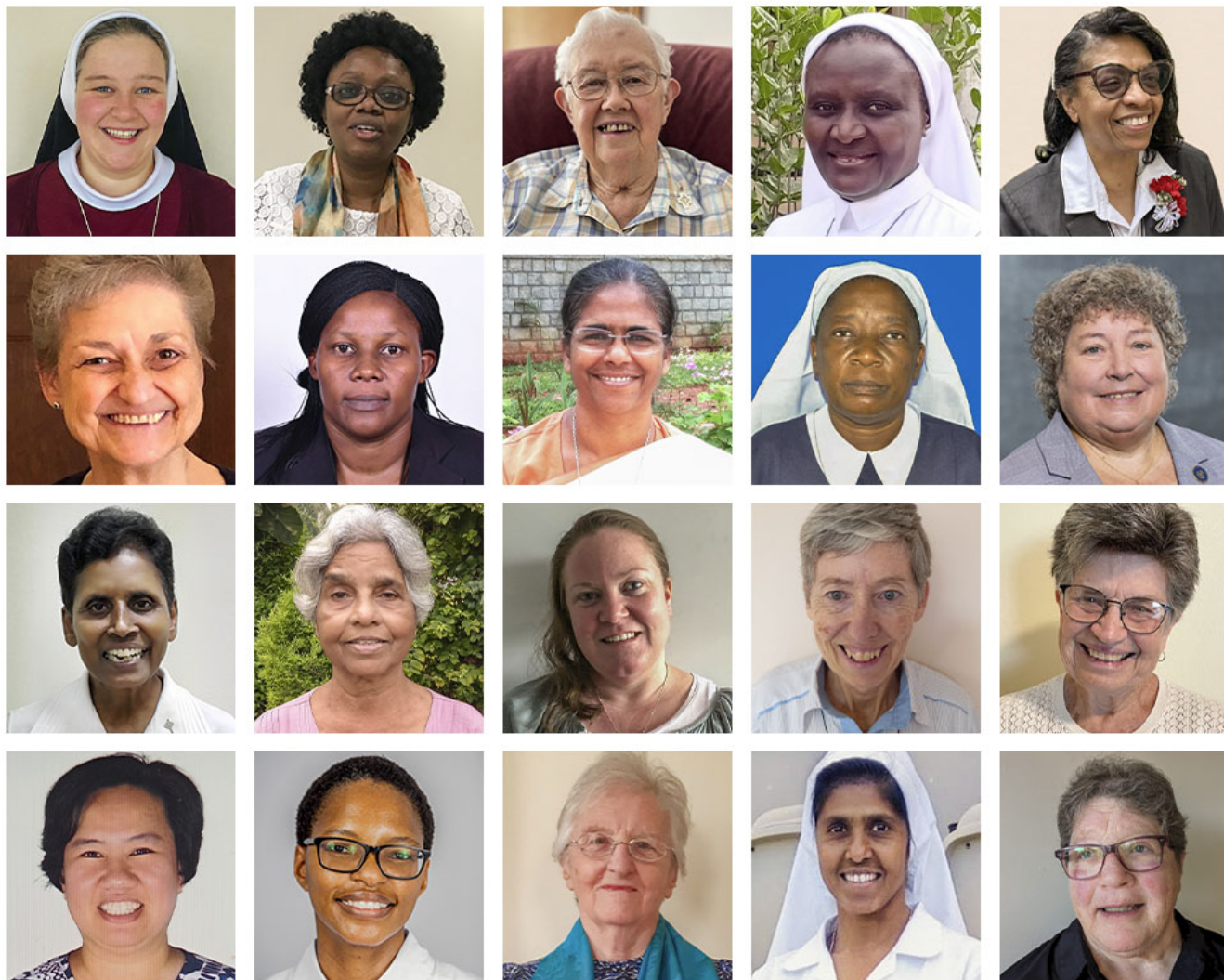
The eighth panel for Global Sisters Report's feature The Life (GSR graphic)