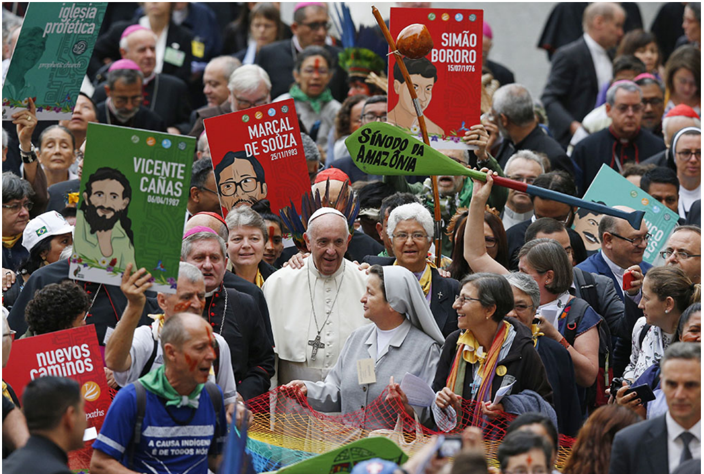
Pope Francis walks in a procession at the start of the Synod of Bishops for the Amazon at the Vatican Oct. 7, 2019.

It was the Amazon synod that first preceded its assembly in Rome with a series of "listening" sessions in which tens of thousands of people from the eight Amazonian countries — Bolivia, Brazil, Colombia, Ecuador, Guyana, Peru, Suriname and Venezuela — and the territory of French Guiana participated. The monthlong Amazon synod also saw men and women — lay, clerical and religious — speak in the sessions, although ultimately only bishops voted on the final document.