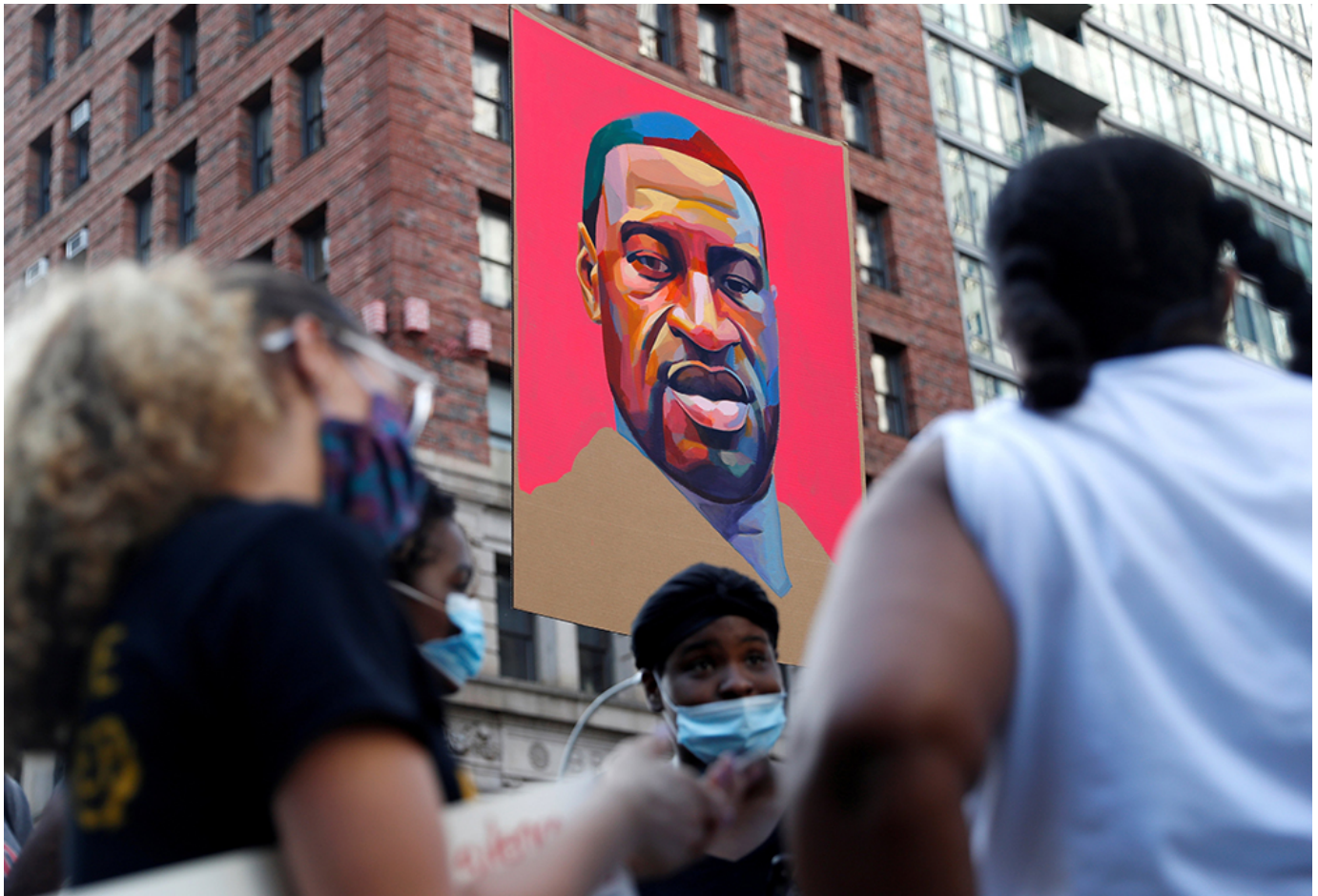
A portrait of George Floyd is seen in New York City during a protest against racial inequality June 8, 2020.

The murder of George Floyd in 2020 heightened — in a very tangible way — the nation's awareness of the crushing impact this legacy has on communities, families and individuals living in the U.S. today.