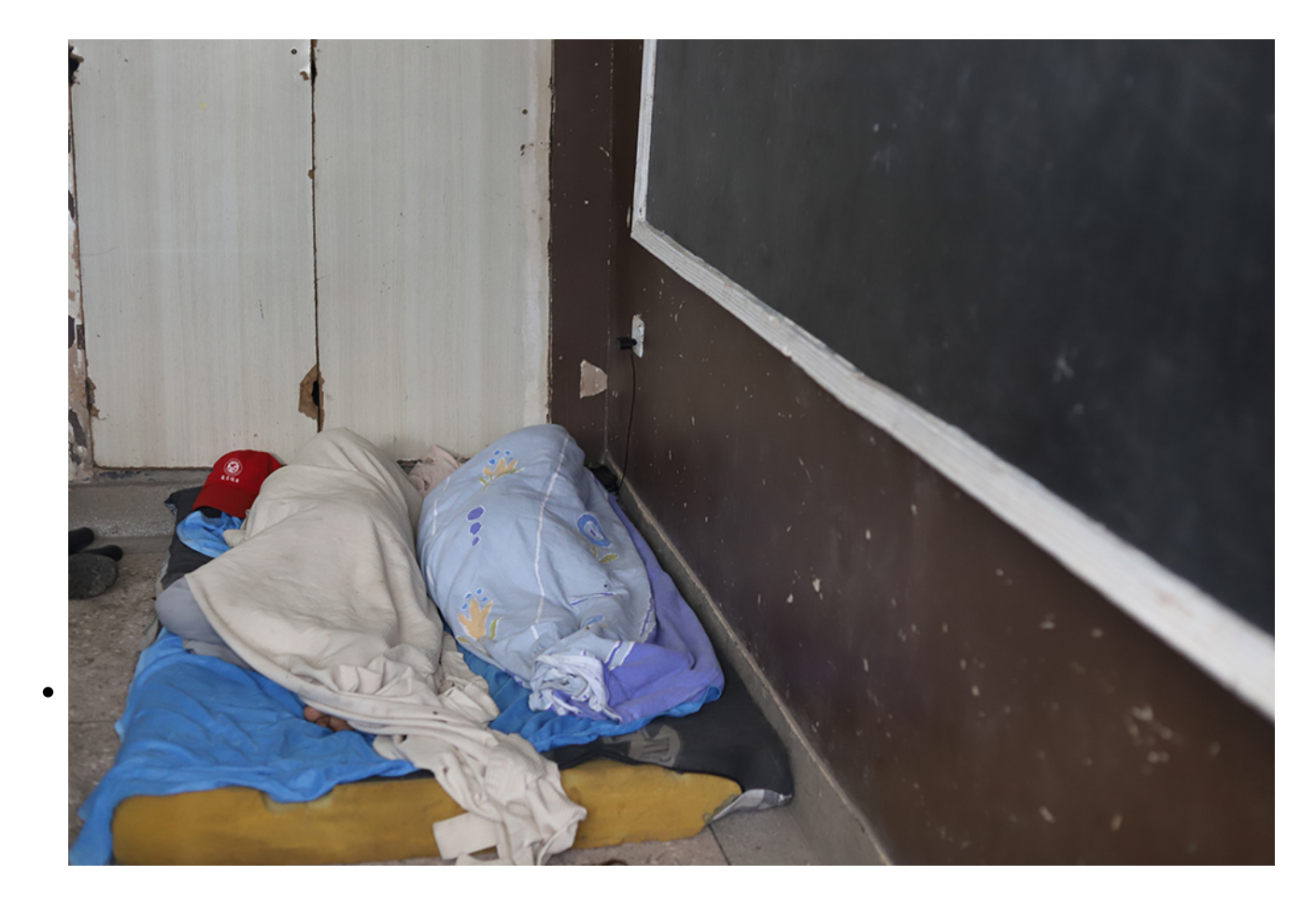
People displaced due to flooding sleep in a school classroom April 17 after their houses were flooded in Nairobi.

While Oduory noted that the majority of children in the Budalangi region are unable to attend school because they are displaced, living in camps or on the streets, Otuoma stressed the profound impact of climate change on people's livelihoods. Beyond just lacking a physical home, homelessness also encompasses the inability to produce food and provide for children, he said.