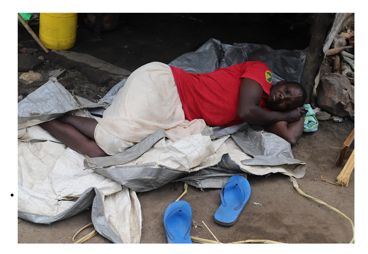
A woman sleeps outside her tent in Khumwanda displacement camp in Busia on July 16, after floods swamped her house.