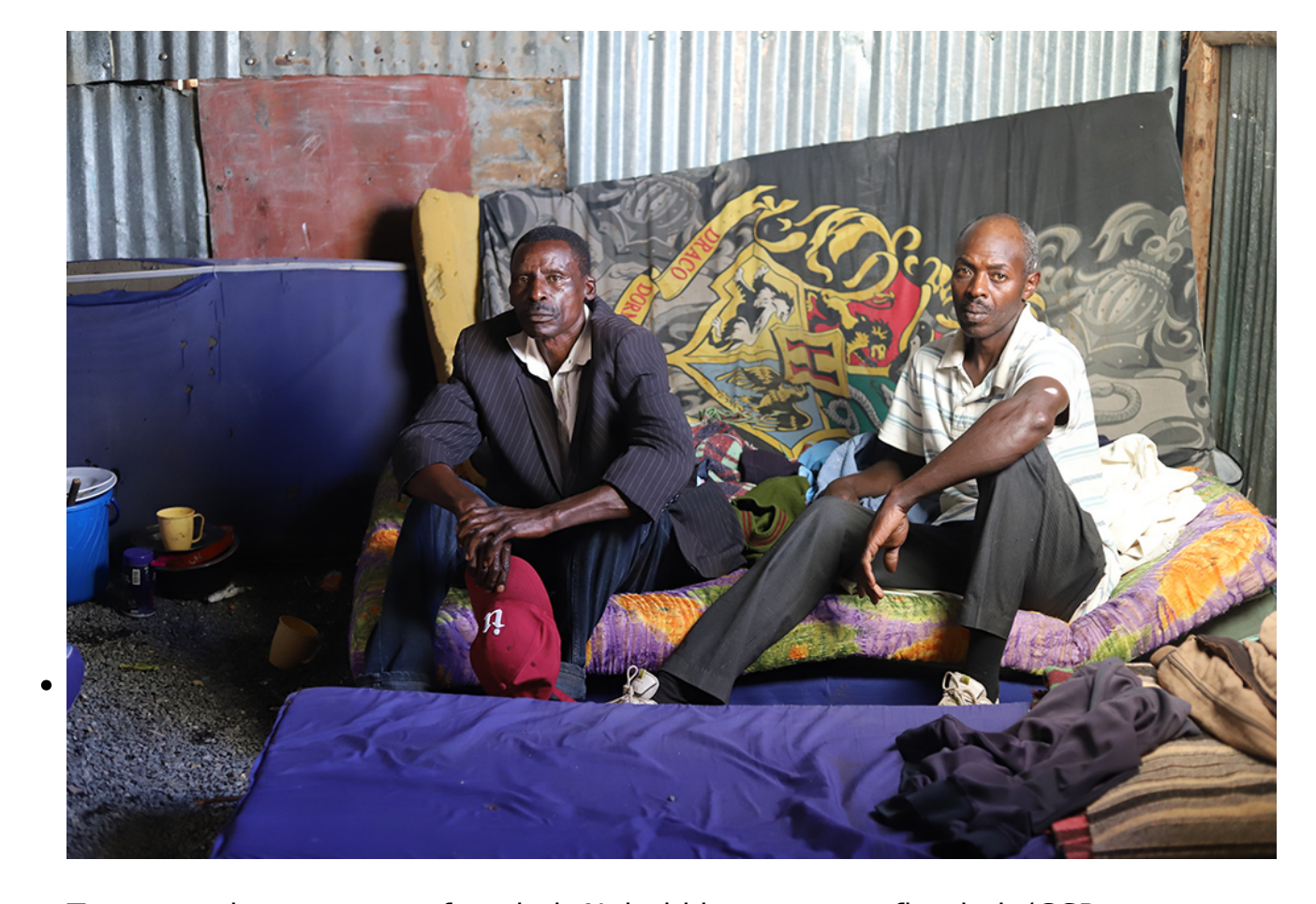
Two men share a room after their Nairobi homes were flooded.