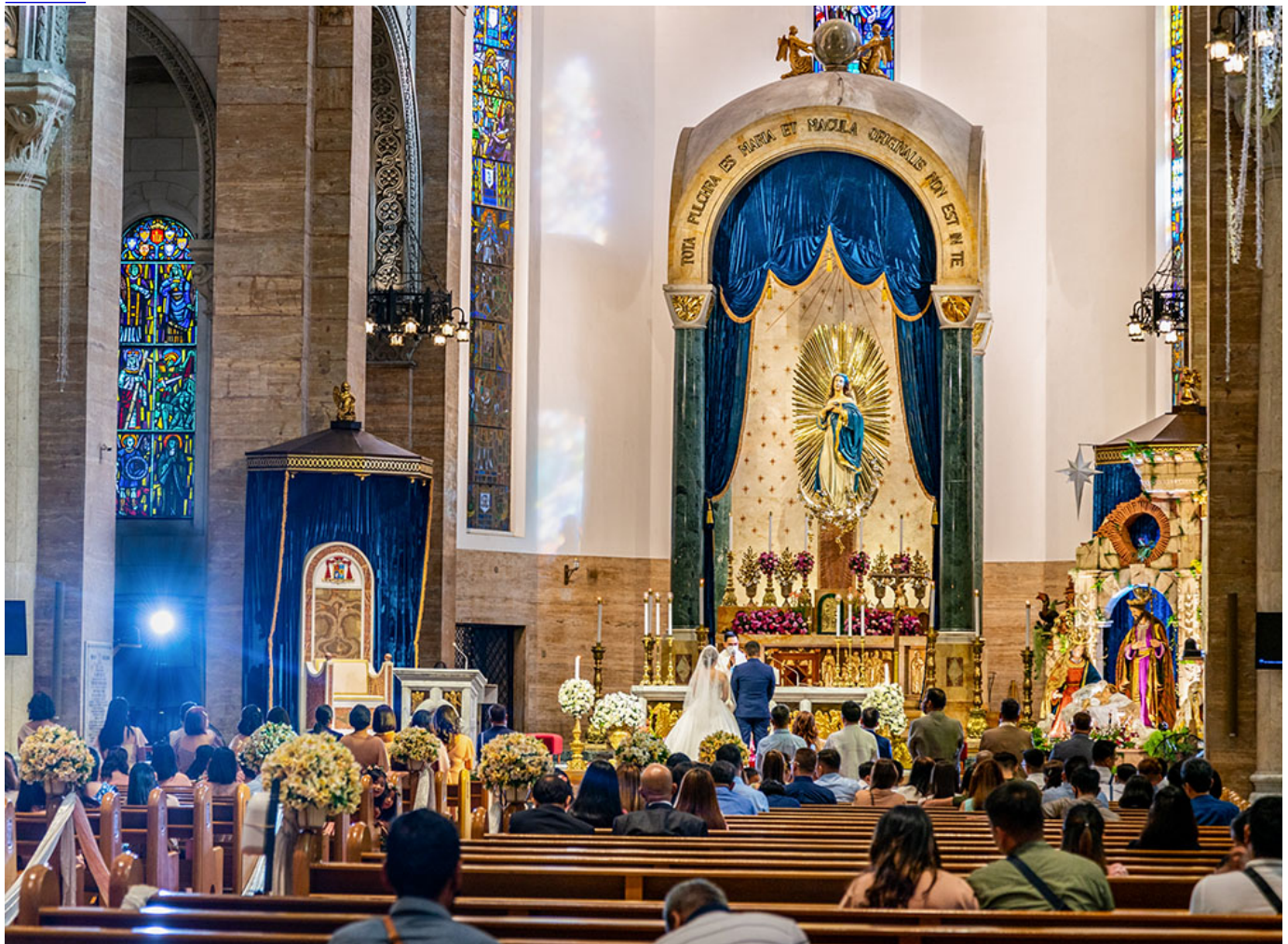
A young Filipino couple is married at the altar of Manila's Cathedral of the Immaculate Conception in the Philippines in 2023.