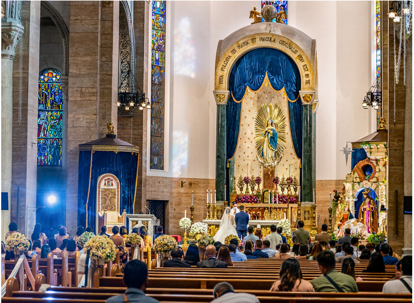
A young Filipino couple is married at the altar of Manila's Cathedral of the Immaculate Conception in the Philippines in 2023.