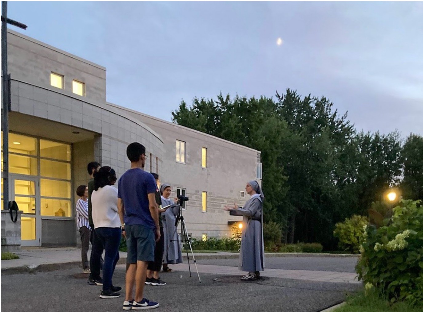
Nighttime filming of the documentary series "The Hidden Good in the City" in front of the Recluse Sisters' monastery in Montreal

The videos can be presented in parishes and groups, which can help to open up a dialogue with the younger generation on the existence and meaning of religious life. The videos can also be used to promote vocational pastoral care.