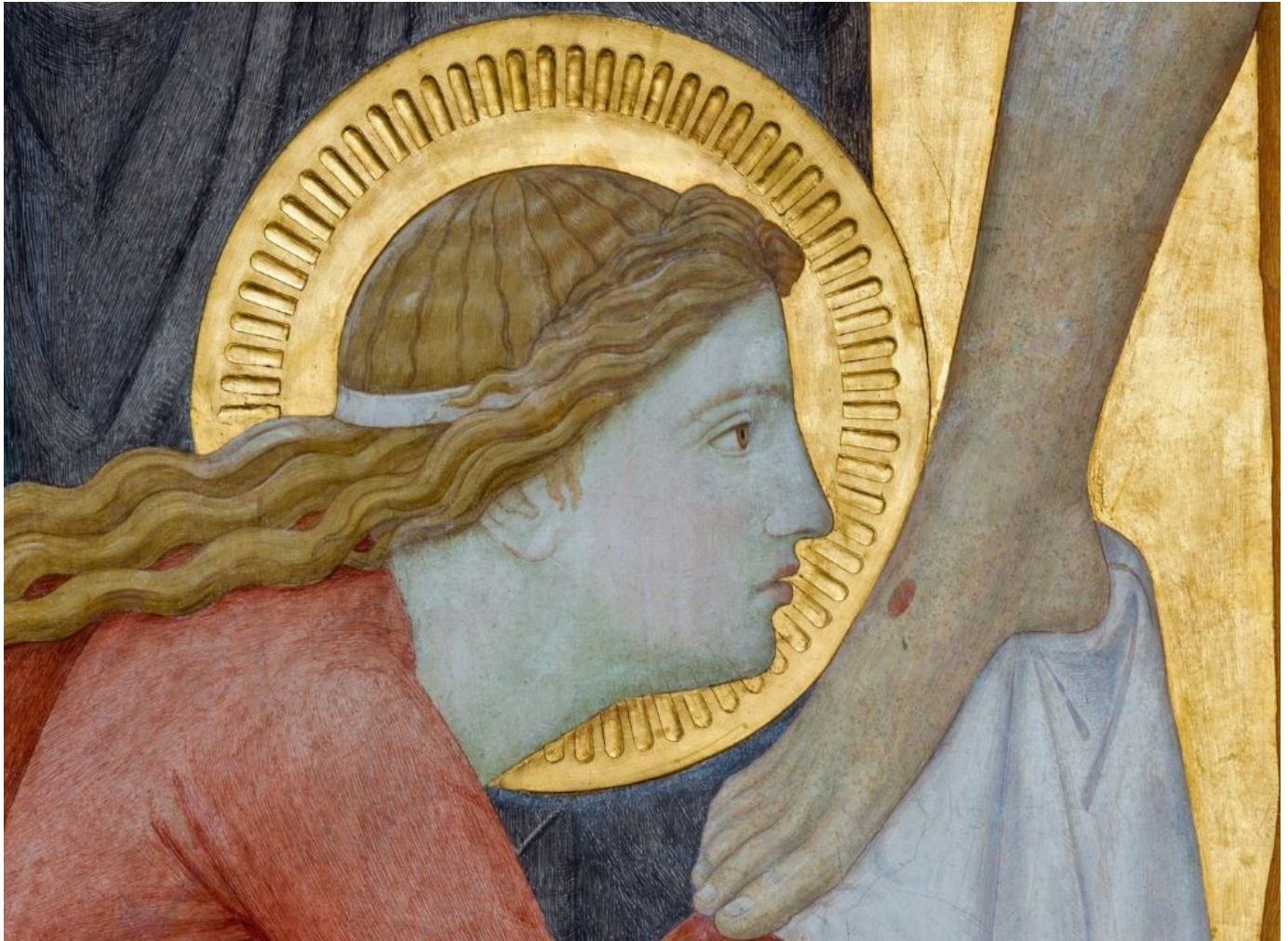
Mary Magdalene washes Jesus' feet in this detail from a fresco in the Carmelite church in Vienna, Austria.