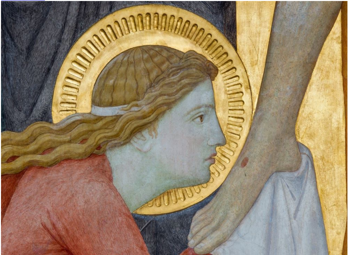
Mary Magdalene washes Jesus' feet in this detail from a fresco in the Carmelite church in Vienna, Austria.