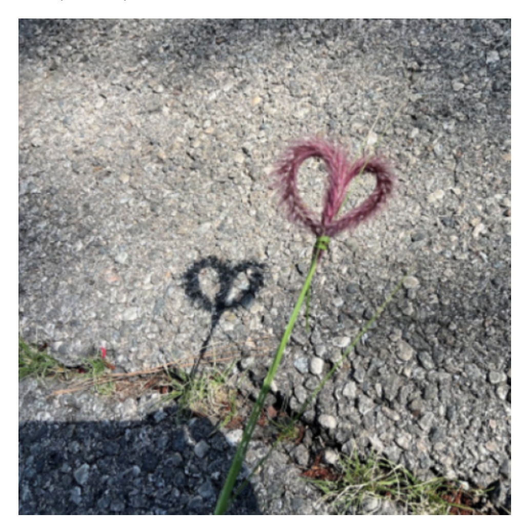
A heart is formed with a plant at Serra Retreat in Malibu.

One of the retreat's core messages was the concept of friendship with God. This relationship opened our eyes to read Scripture differently, fostering a deeper, more personal connection with the divine. By cultivating this friendship, we were able to engage with our faith on a more intimate level, finding new meaning and insights in our spiritual practices.