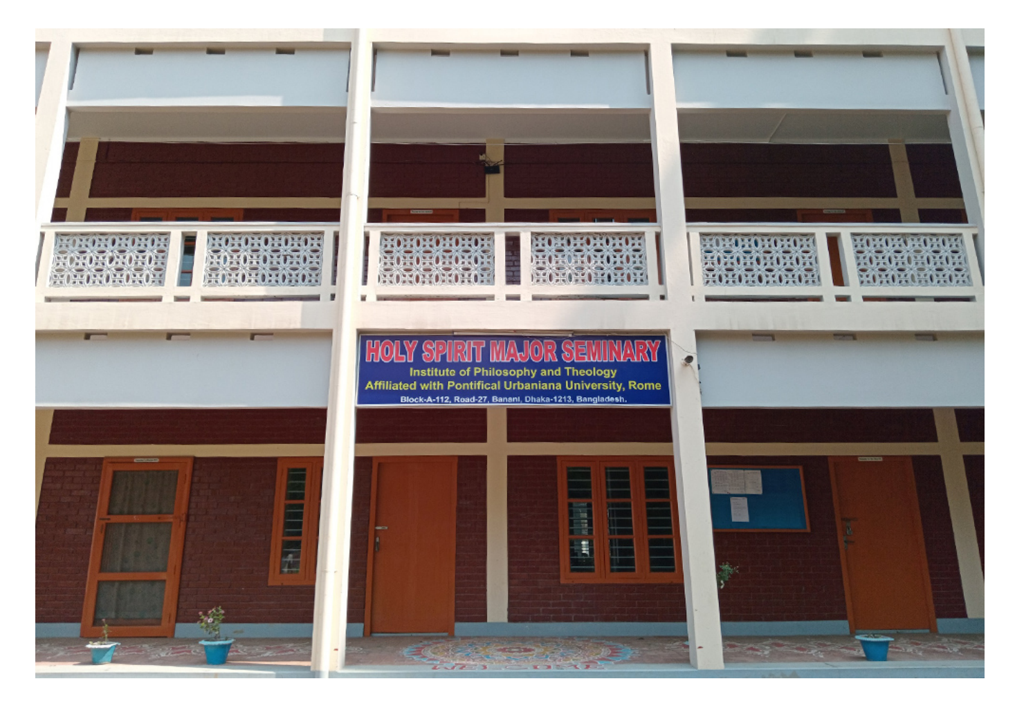
Holy Spirit Seminary, Banani in Dhaka, Bangladesh (Sumon Corraya)