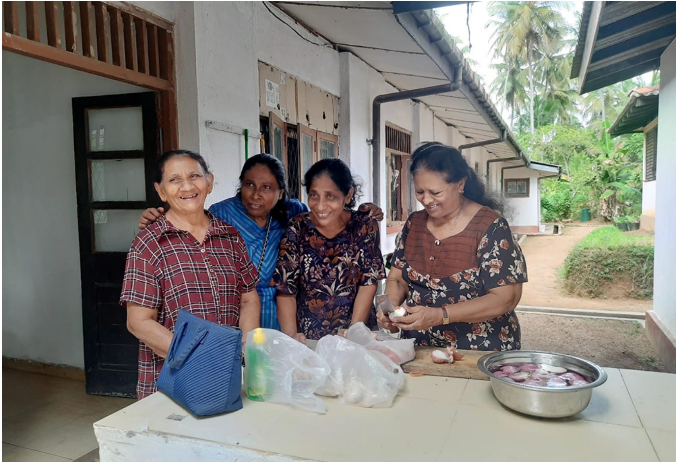
Lay Salvatorians prepare food for distribution at the cancer patients' hospital in Kurunegala, Sri Lanka.

There is a long history of third degree or third order members in the Catholic Church, sometimes known as tertiaries. According to the publication Give Us This Day , a young couple approached St. Francis of Assisi and asked for a way to follow his path without having to separate to enter religious life. St. Francis, who had wanted a "Third Order" for laypeople, clothed the couple in the "plain habit and cord of the order," and they became the first tertiaries in the Franciscan order.