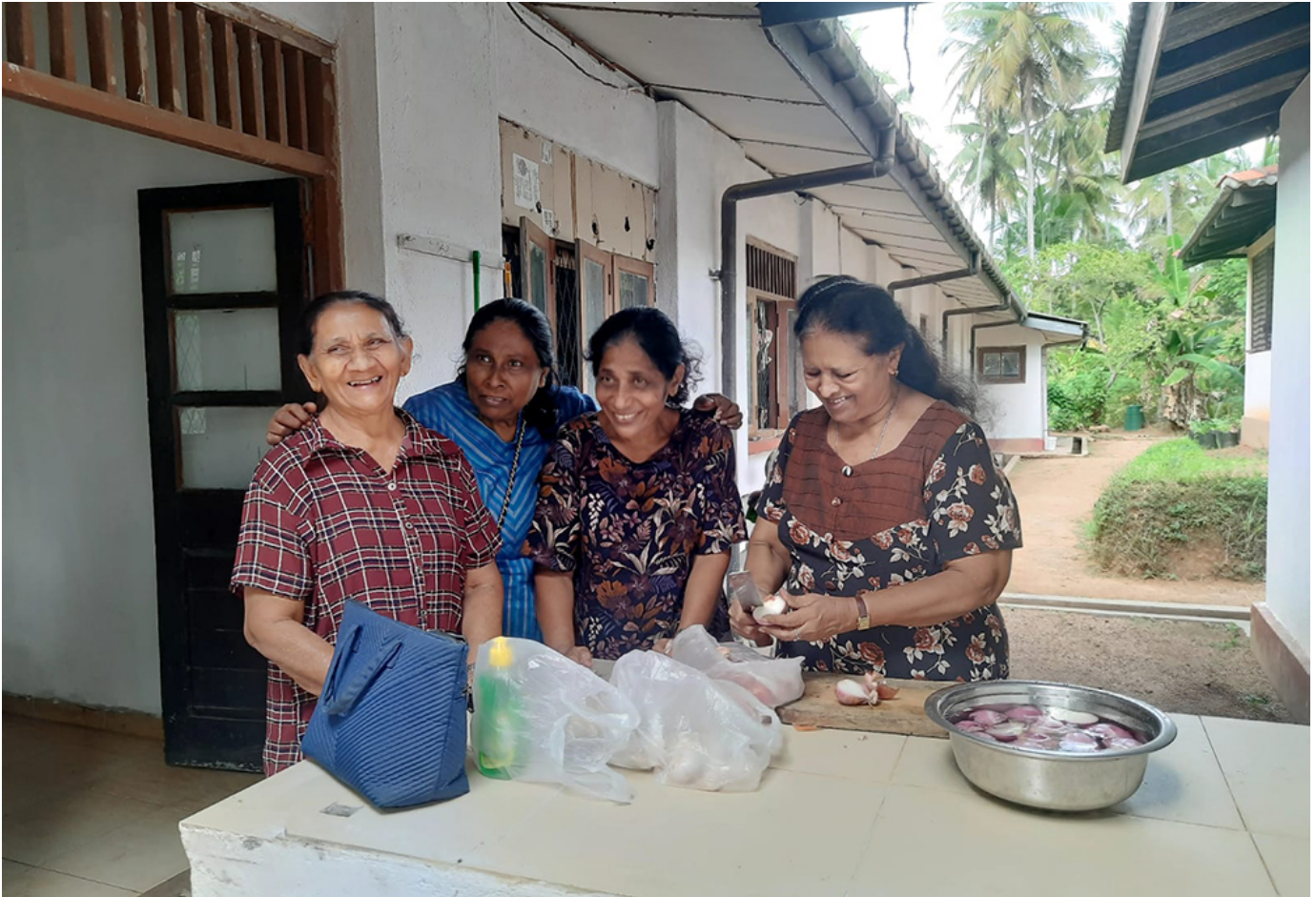
Lay Salvatorians prepare food for distribution at the cancer patients' hospital in Kurunegala, Sri Lanka.

There is a long history of third degree or third order members in the Catholic Church, sometimes known as tertiaries. According to the publication Give Us This Day , a young couple approached St. Francis of Assisi and asked for a way to follow his path without having to separate to enter religious life. St. Francis, who had wanted a "Third Order" for laypeople, clothed the couple in the "plain habit and cord of the order," and they became the first tertiaries in the Franciscan order.