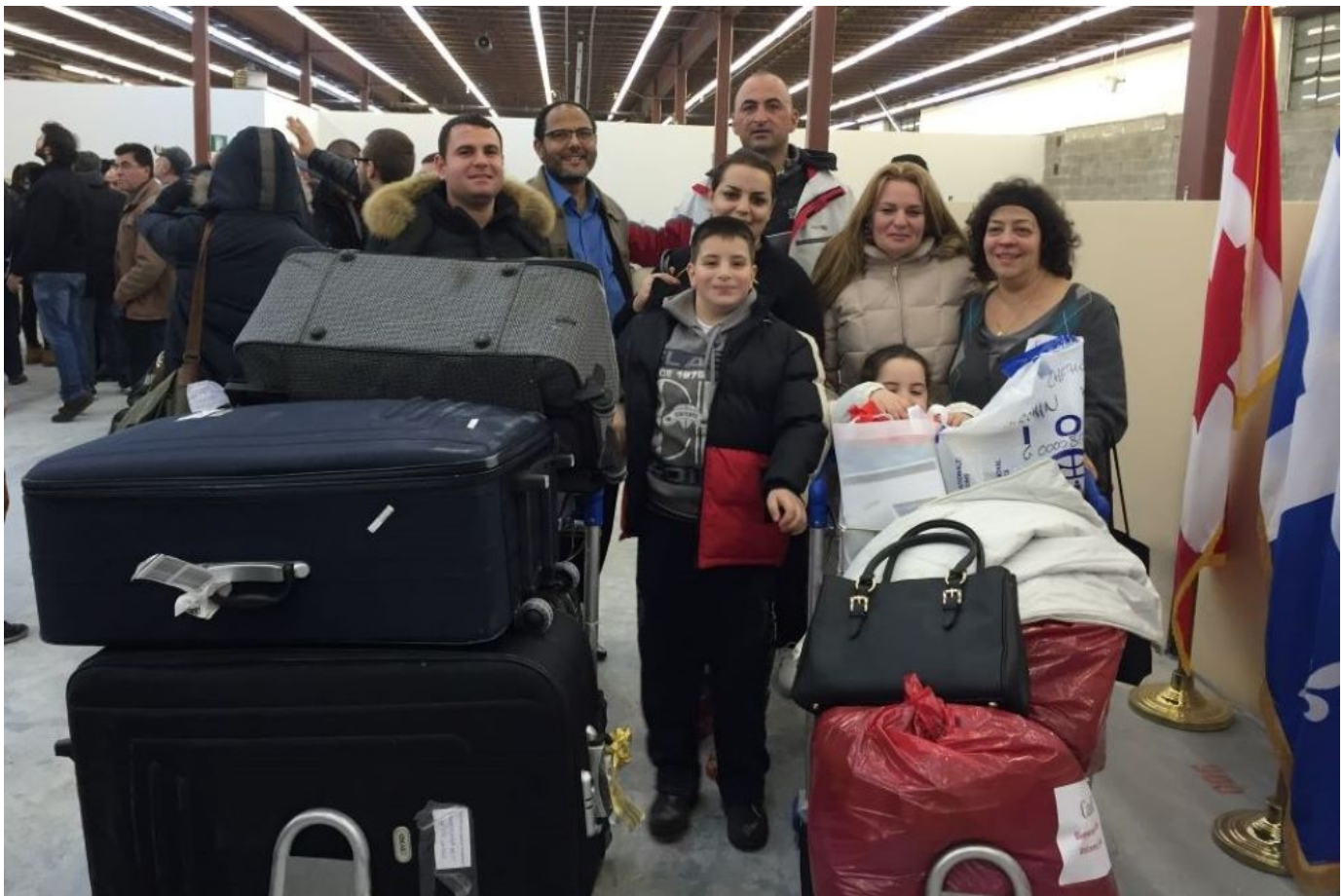
Families arrive at the Refugee Reception Center during the arrival of many Syrian families sponsored by the Franciscan Oblates of St. Joseph 2015-2016.

The sisters are also dedicated to helping refugees integrate socially by organizing birthday parties, Christmas celebrations and trips to Quebec, or to visit the sanctuary in Cap-de-la-Madeleine . Finally, they also organize formation sessions about legislation in Quebec to help refugees familiarize themselves with the law.