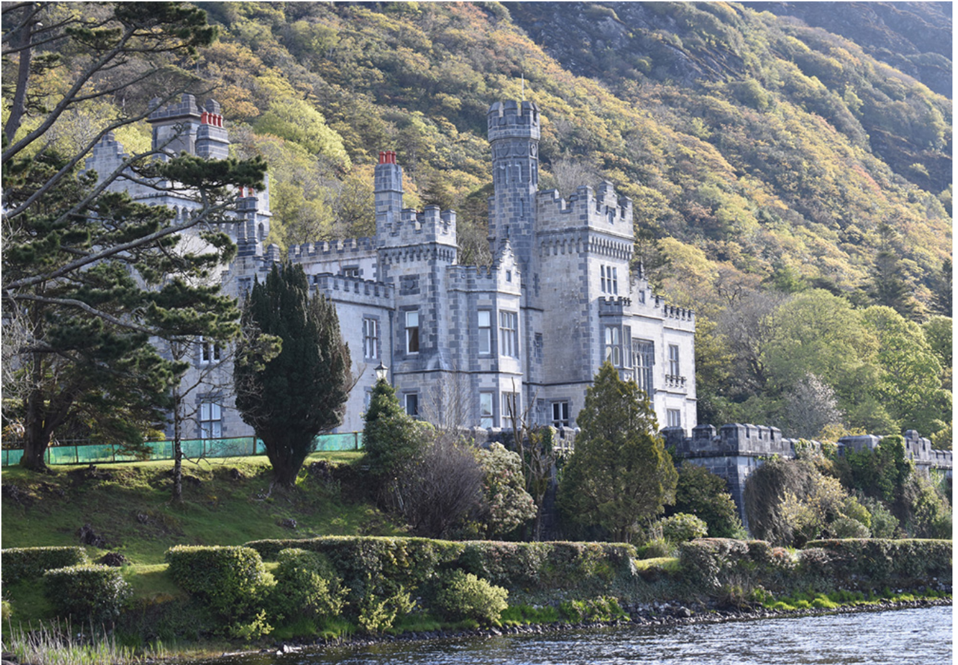
Kylemore Abbey in Connemara, Ireland