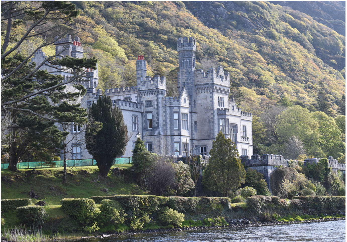
Kylemore Abbey in Connemara, Ireland