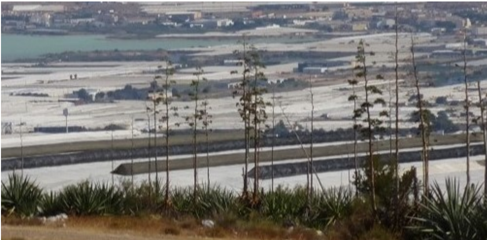
• As intensive greenhouse agriculture grew, people began to arrive from Morocco, Senegal, Guinea Bissau, Ghana, the Ivory Coast, Mali and Mauritania.