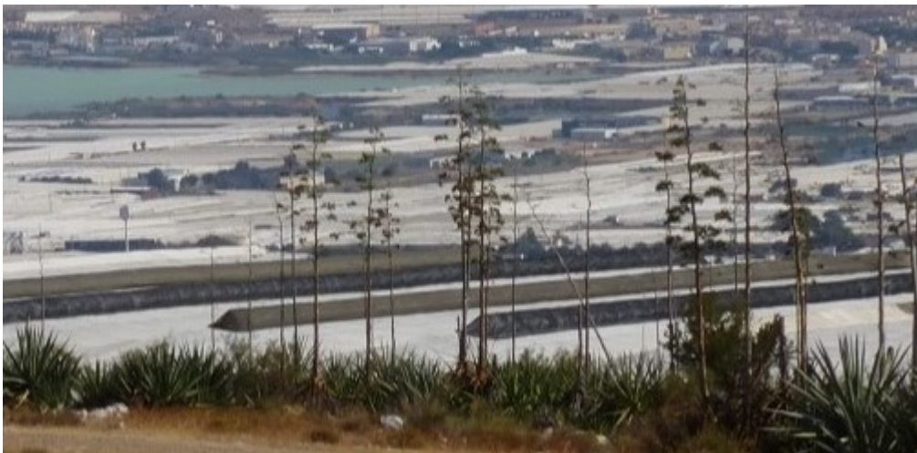
As intensive greenhouse agriculture grew, people began to arrive from Morocco, Senegal, Guinea Bissau, Ghana, the Ivory Coast, Mali and Mauritania.