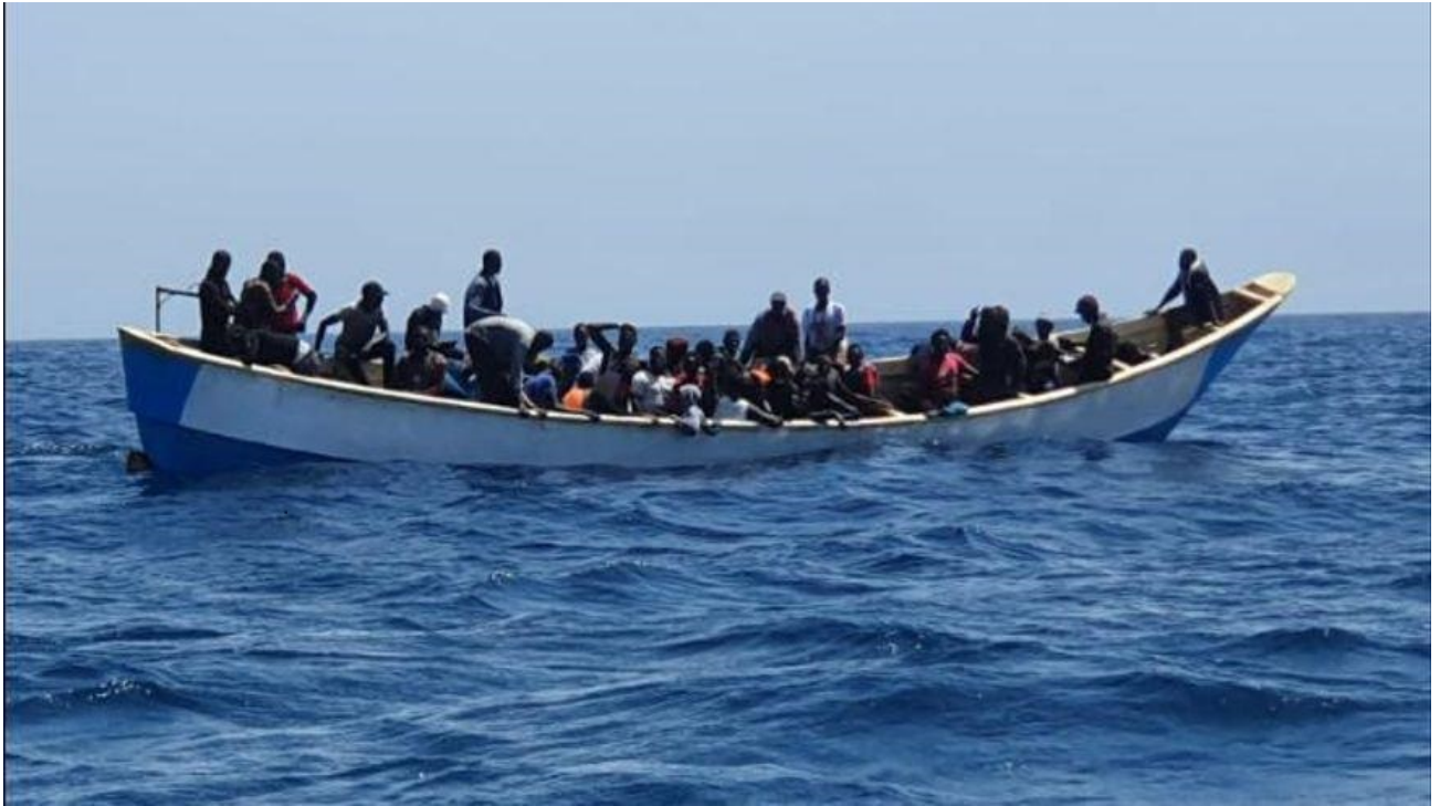
Boat of one of the migrants who arrived in Almería, Spain.