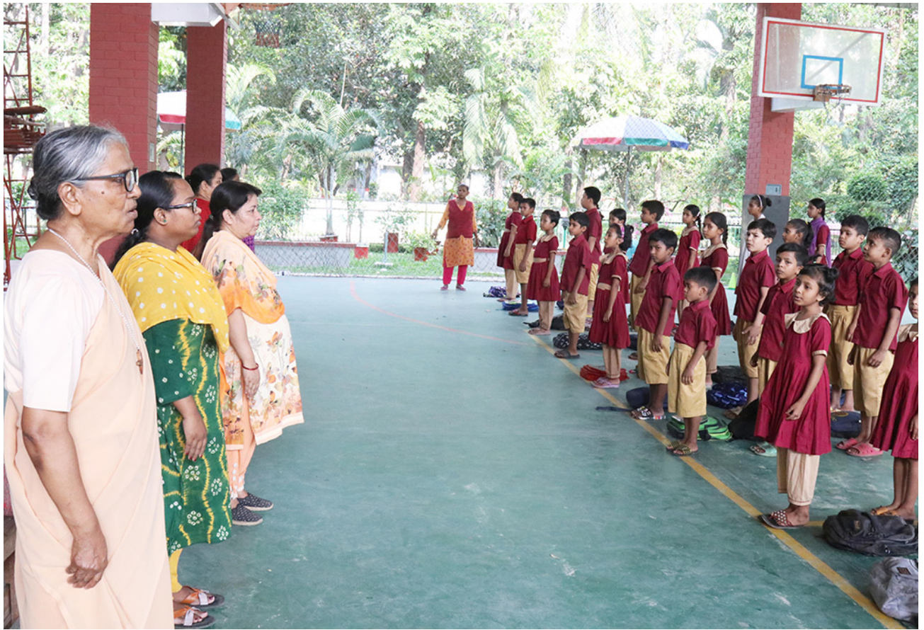
Teachers and students sing the national anthem of Bangladesh in the assembly before the start of class. (Stephan Uttom Rozario)