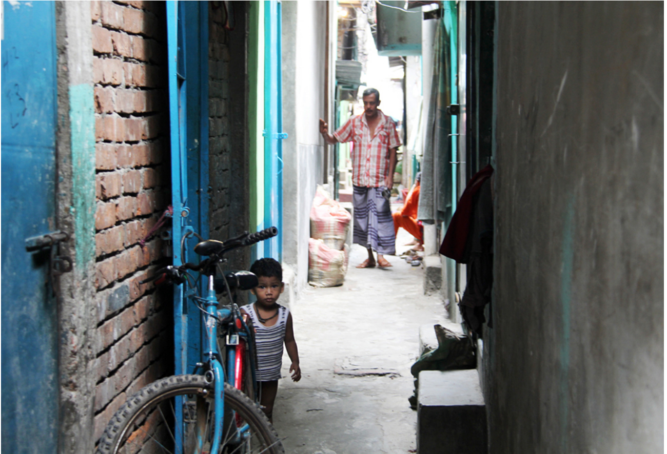
Geneva Camp in Dhaka's Mohammadpur area is a densely populated settlement of tens of thousands of Biharis.