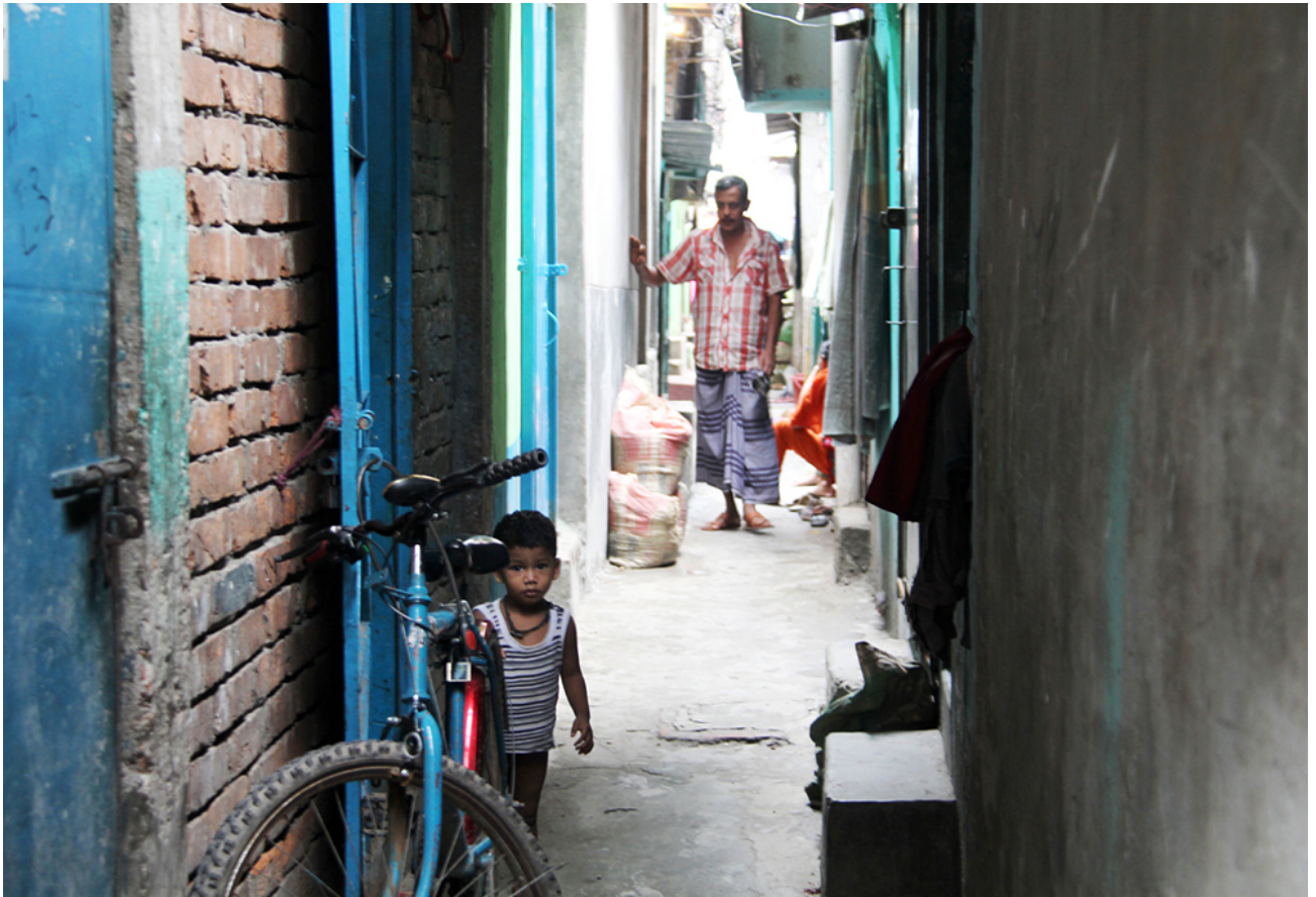
Geneva Camp in Dhaka's Mohammadpur area is a densely populated settlement of tens of thousands of Biharis.