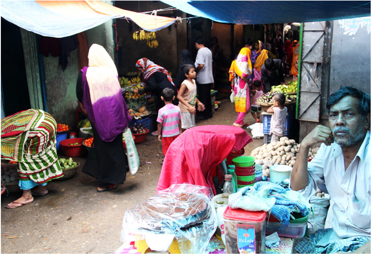
Inside the camp, there are small shops where all kinds of daily necessities from vegetables are available; Biharis are both buyers and sellers. (Stephan Uttom Rozario)