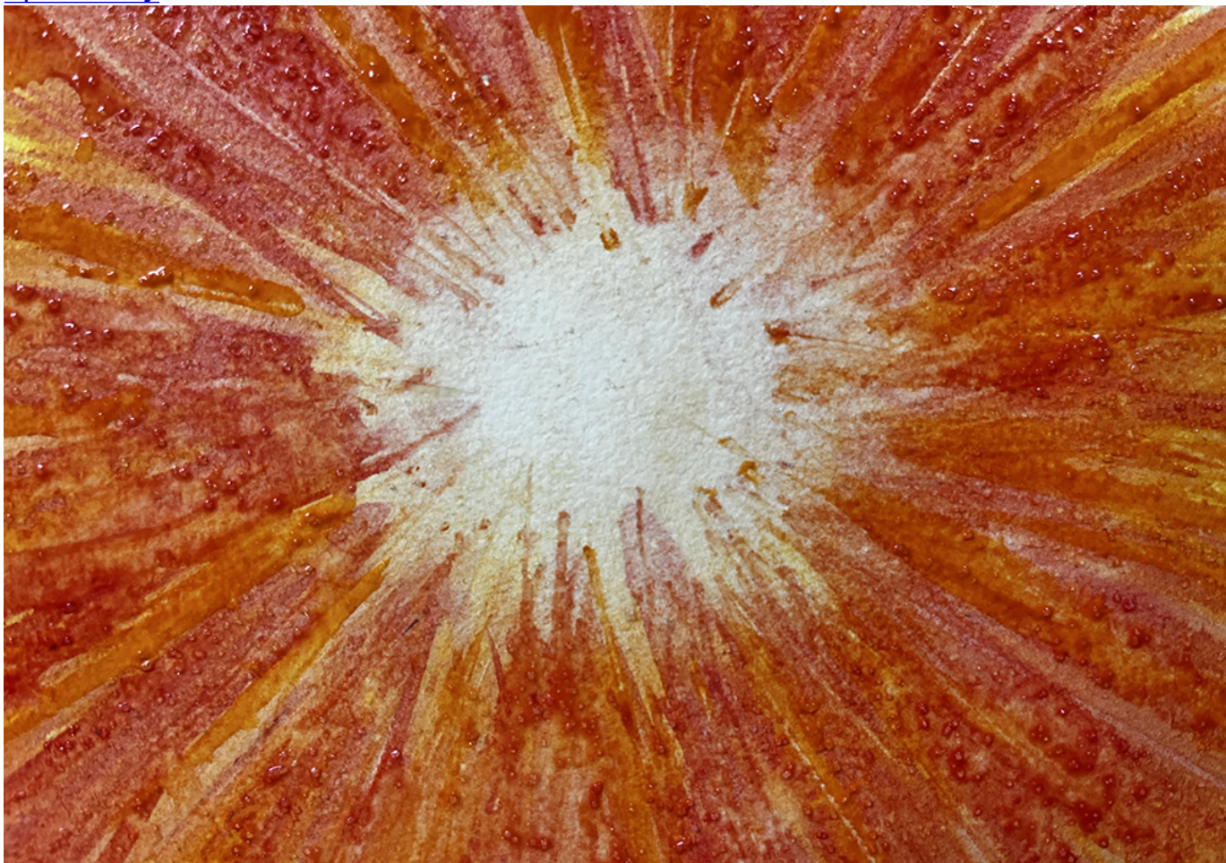
"Easter Morning Sun," by Sr. Paulette Kirschensteiner