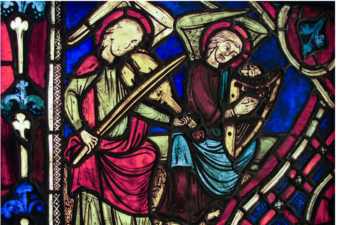
Angels play music in medieval stained glass at the Musée de Cluny in Paris.

Our understanding, our comprehension of reality, is our whole embodied self, made of mind, feelings and imagination.