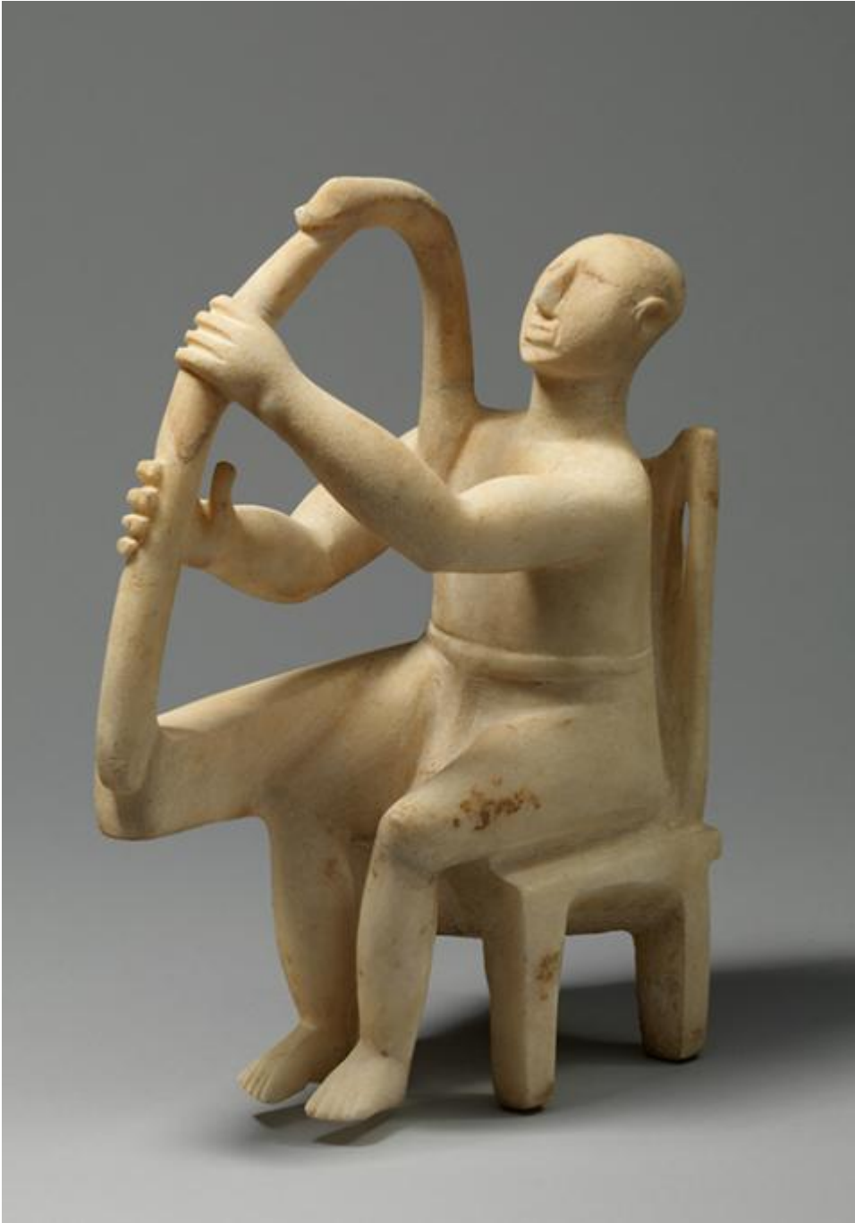
Marble seated harp figure, Cycladic culture, 2800-2700 B.C. (Metropolitan Museum of Art)

arts both can be prophetic and are being prophetic. So, people are coming in sideways and saying, "No, we need to stretch things." That's part of what I'm trying to do.