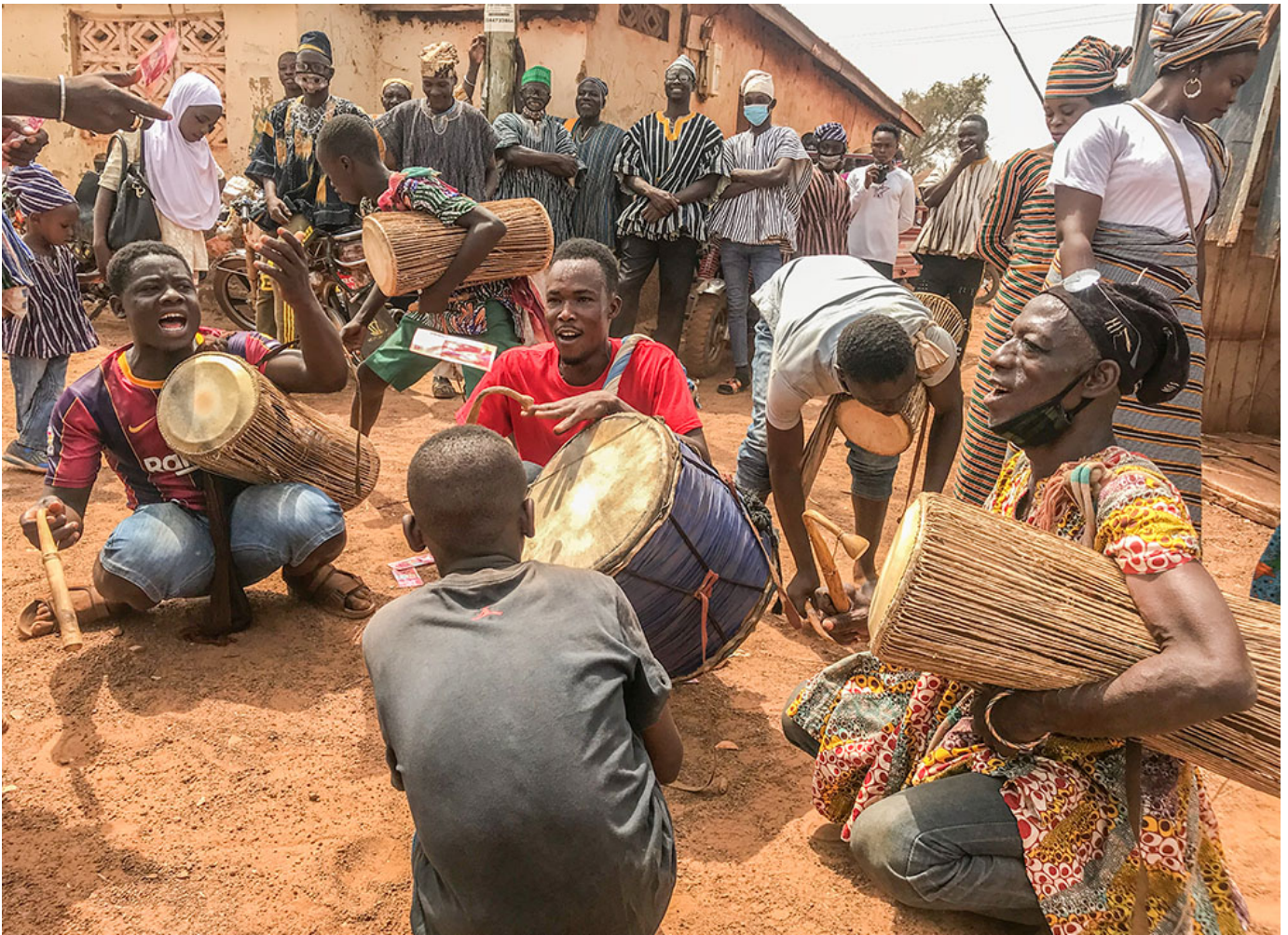
A group of local drummers and dancers from Vitting village in Tamale, Ghana

We're being invited to be aware of the different levels of our sense of things. So, our psyche isn't just theory or organization, it's also relationality, connectivity, imagination, culture, interaction, men and women, different cultures. All of that is messy, but it's rich.