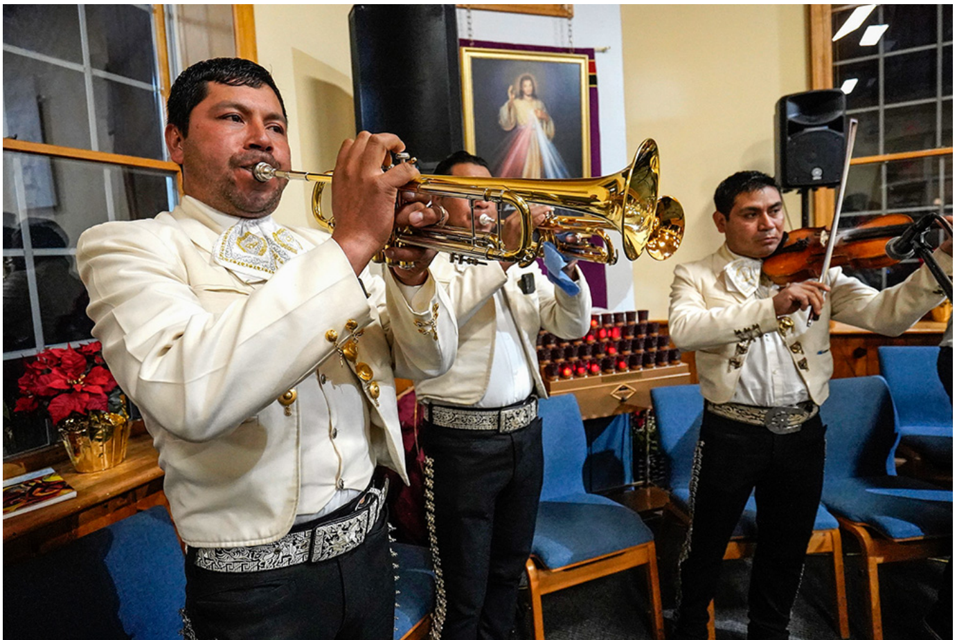
A mariachi band plays music during a Spanish-language Mass marking the feast of Our Lady of Guadalupe at Resurrection Church in Farmingville, New York, Dec. 12, 2021.

So, the concern of this book is about faith translation as well, and how we need to dialogue with music and culture.