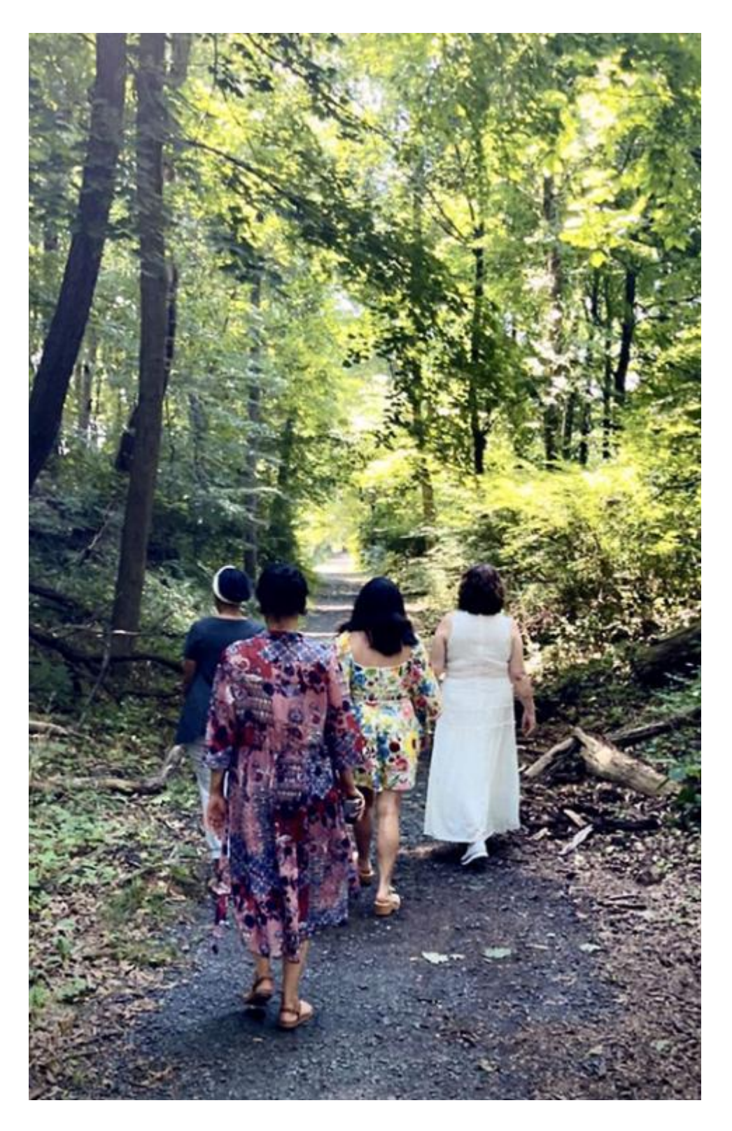
Survivors enjoy a LifeWay Network outing.