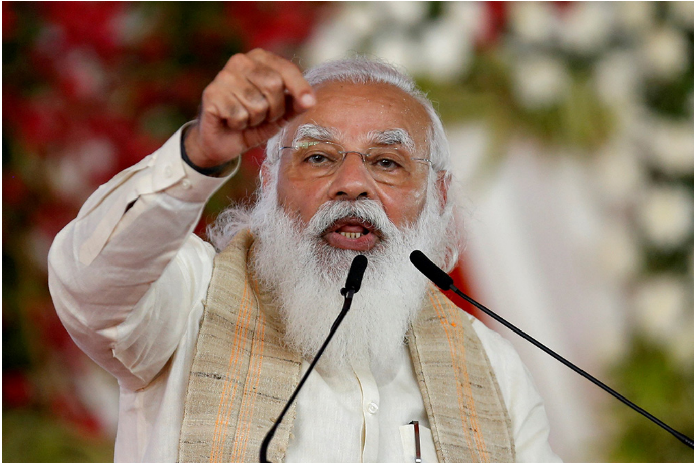
Indian Prime Minister Narendra Modi is pictured in a March 12, 2021, photo.

The anti-conversion laws implemented by the current regime exacerbate the marginalization and diminishing status of Christians. This religious group, along with Muslims, has been subjected to targeted hatred, mob lynching, and segregation due to policies directly affecting minority communities.