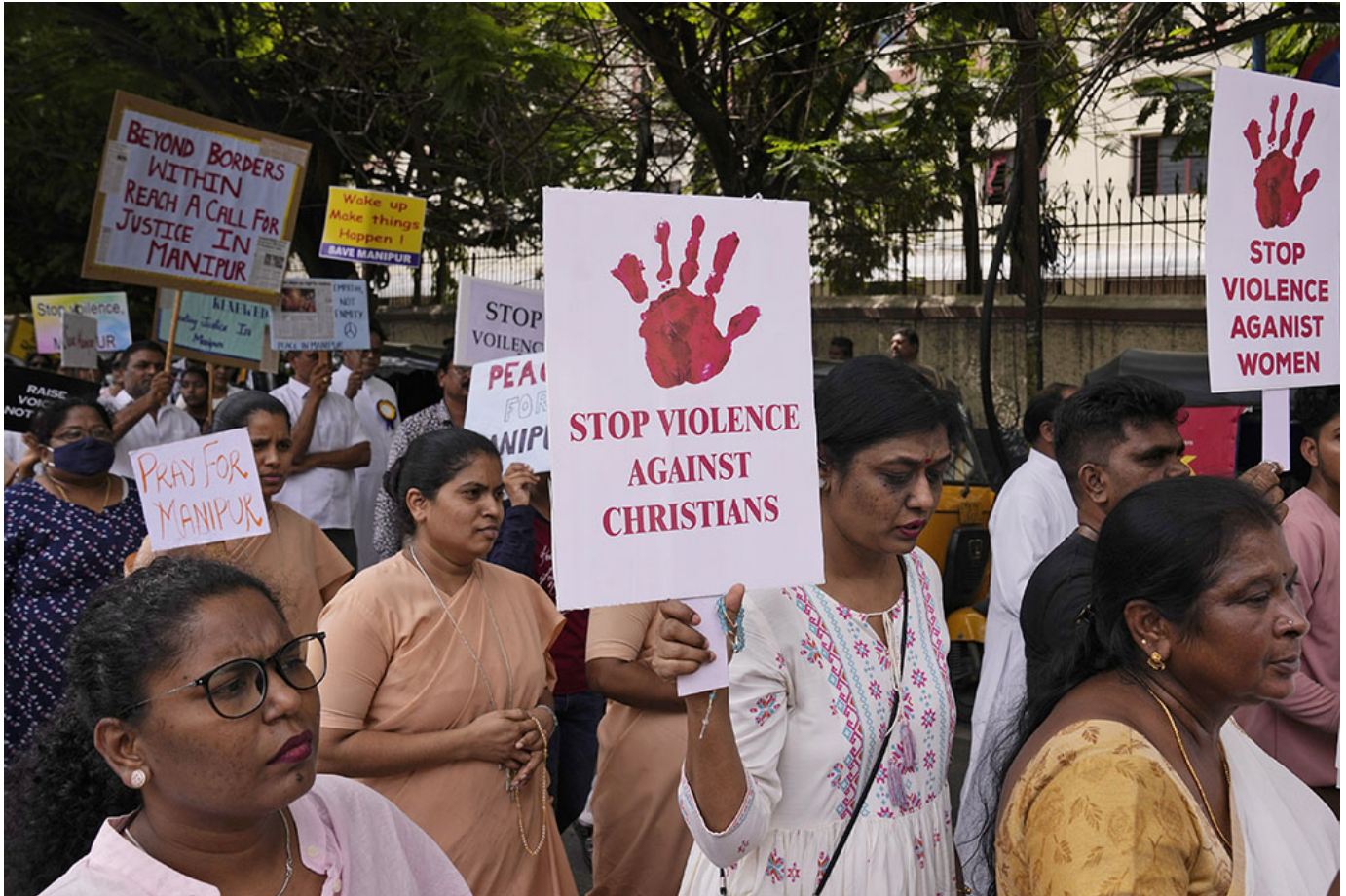
Catholic Christians hold placards and participate in a peace rally against violence in the northeastern Manipur state, in Hyderabad, India, Aug. 25, 2023.