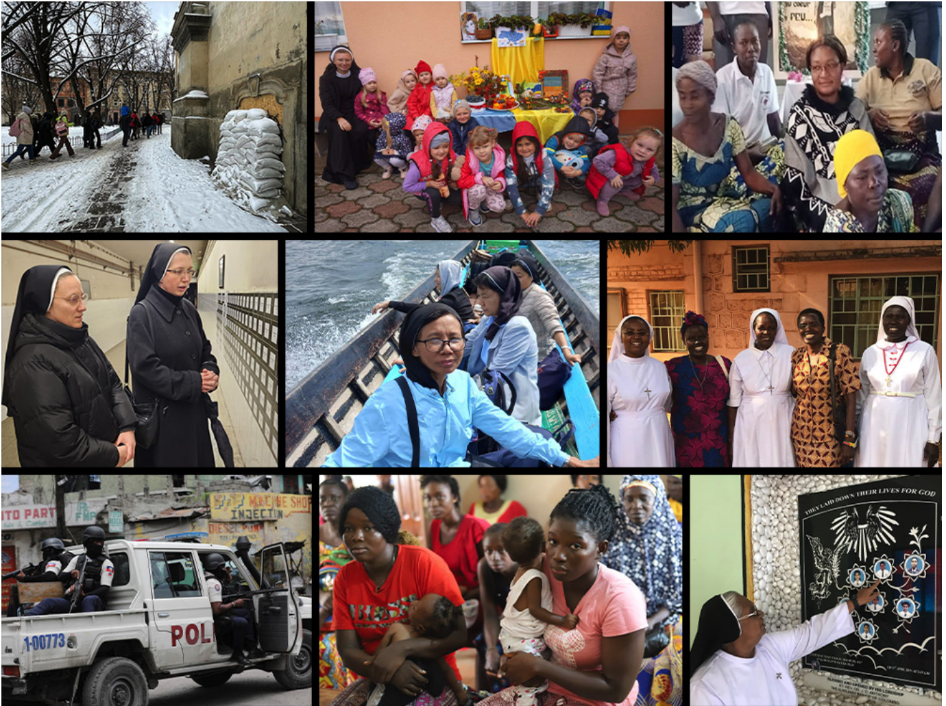
From left, top row: Lviv, Ukraine; Perekhyn, Ukraine; Kiwanja, Rutshuru, Democratic Republic of Congo.