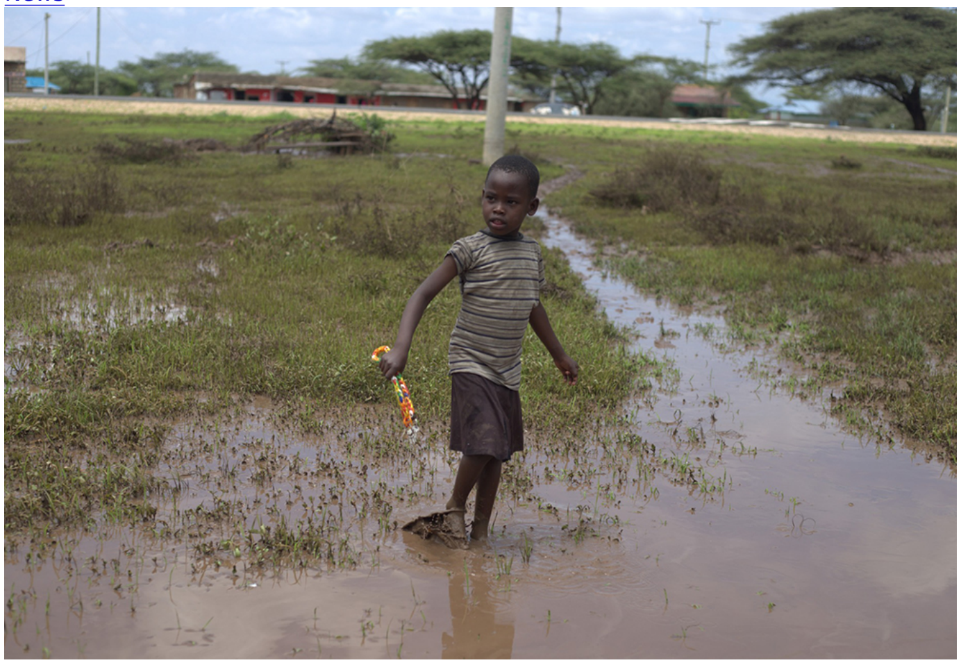
A child walking through the flooded water in Samburu, northern Kenya, on Nov. 9.