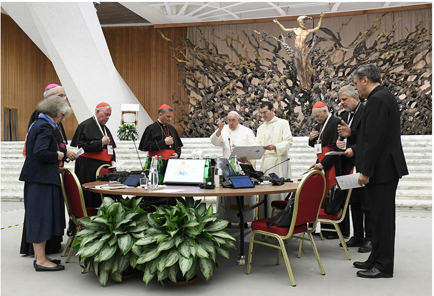
Pope Francis gives his blessing at the conclusion of the assembly of the Synod of Bishops' last working session Oct. 28, 2023, in the Paul VI Hall at the Vatican.

The Holy Spirit could not have stirred the heart of Pope Francis at a more urgent time, considering the division, intolerance, indifference, exclusion, and inequality in our world. Since the onset of the synod, there has been a profound conversion experience across various groups in my community, deeply impacting our core values and ideals in religious life, a witness of the Catholic Church in glory. The synod has called for an overhauling of the systems of operation within the church and her structures, while preserving the rich traditions and cultures that have stood the test of time. There is a great sense of hope that the conclusion of the general gathering of the synod delegates will yield abundant fruits.