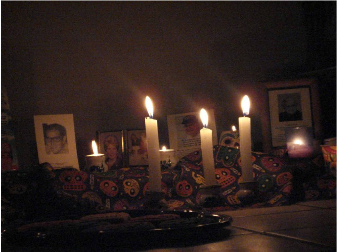
Day of the Dead altar at Benedictine Monastery Pan de Vida [Bread of Life] in Torreon, Mexico.