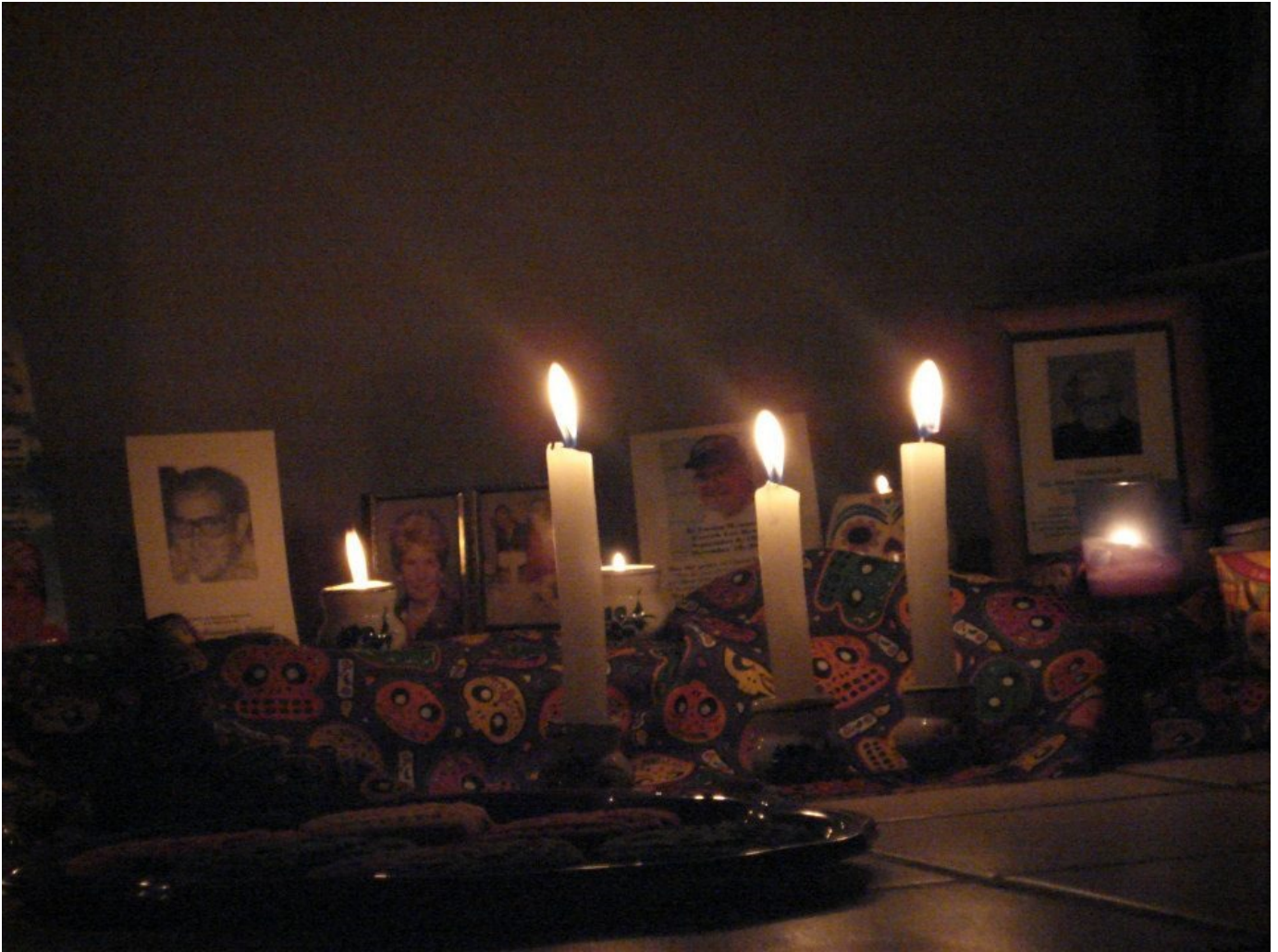
Day of the Dead altar at Benedictine Monastery Pan de Vida [Bread of Life] in Torreon, Mexico.