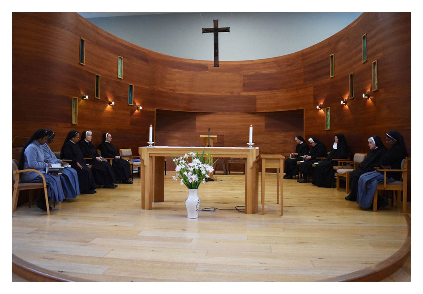
The Benedictine Sisters of Kylemore Abbey gather for morning prayer in their chapel.

Adding the environment/stewardship as a fifth pillar to the four adapted from St. John Paul II's <u>pillars of priestly formation</u> for oblates (humanity, communal, spiritual, intellectual) —especially since many oblates are already quite involved in working to save the planet — is another concept.