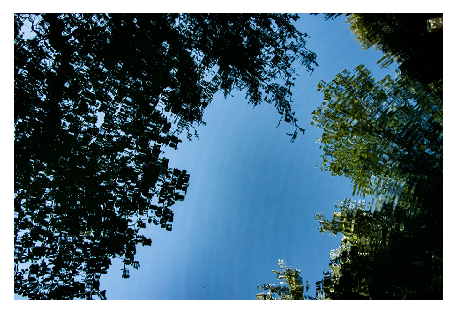
I gradually started to understand the way God was speaking to me: from the inside.

As I tried to follow God's will — every year, I would take a few days' retreat to decide about the following year — I genuinely came to believe one day that God had forgotten about me. Despite all my efforts to listen to him, my life was going around in circles. Worse, I started to think that at one of the crossroads in my life, I had taken the wrong path and that it was the reason why I had become unable to hear God's call.