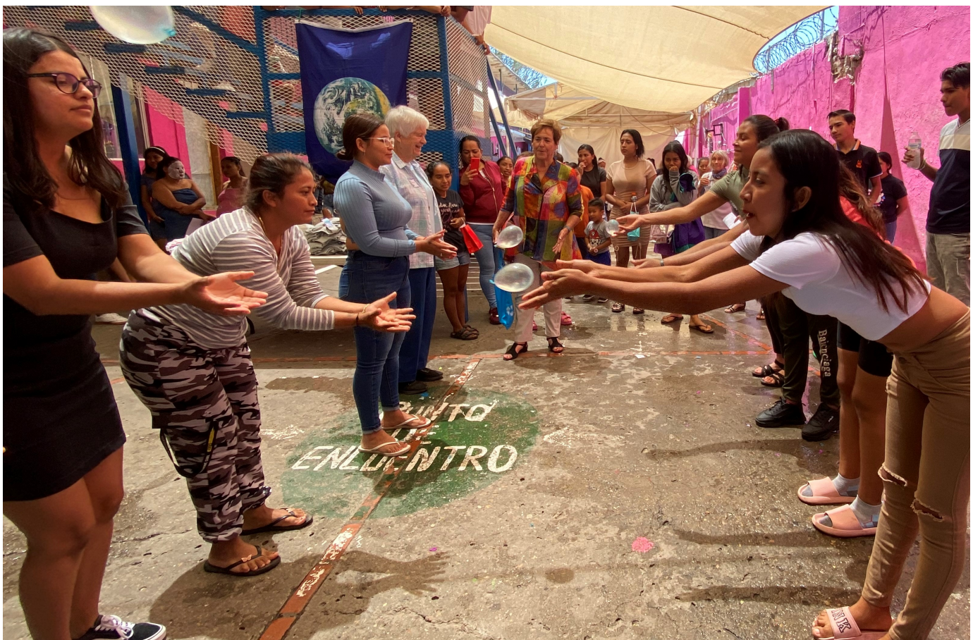
Migrant women play a game with water balloons at the Cobino migrant shelter in Mexicali, Mexico May 10. The games were part of a visit by women religious who

The measure, implemented during the Trump administration, kept asylum-seekers out of the U.S. since the coronavirus pandemic began in early 2020. It allowed border patrol agents to rapidly expel those seeking to apply for asylum, allegedly to control the spread of COVID-19.