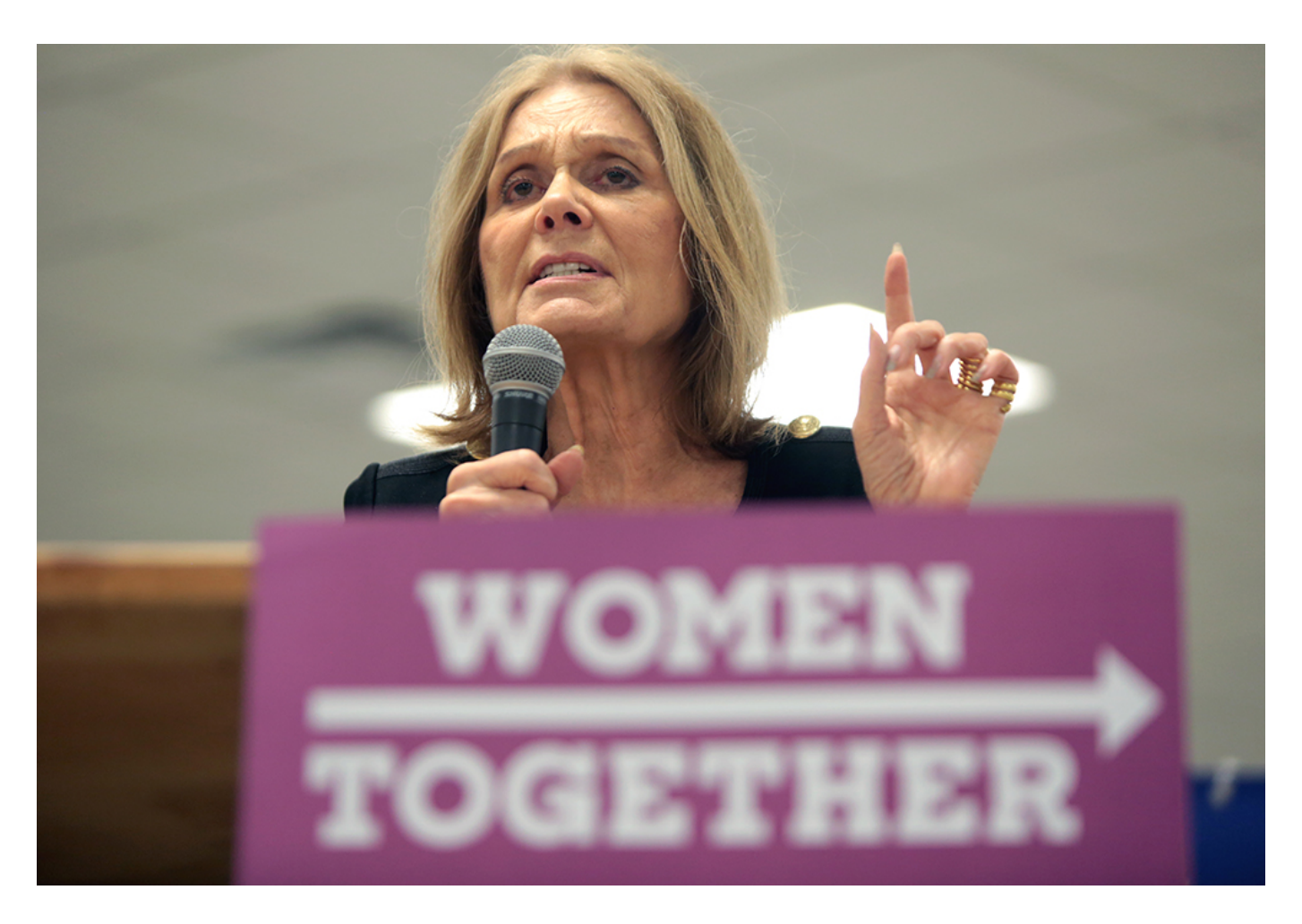
Gloria Steinem speaks with supporters at the Women Together Arizona Summit at Carpenters Local Union Sept. 17, 2016, in Phoenix, Arizona.

The basic difference between the sexes is an example of how nature creates diversity. Feminists are men and women with different orientation, having intellectual capacity and heroic courage for daringly challenging religious and political powers. In a gendered society feminists are seeking not absolute equality (which is practically impossible), but the right to be treated on a par with other human beings. Feminism is a fight for recognition of the worth of every being.