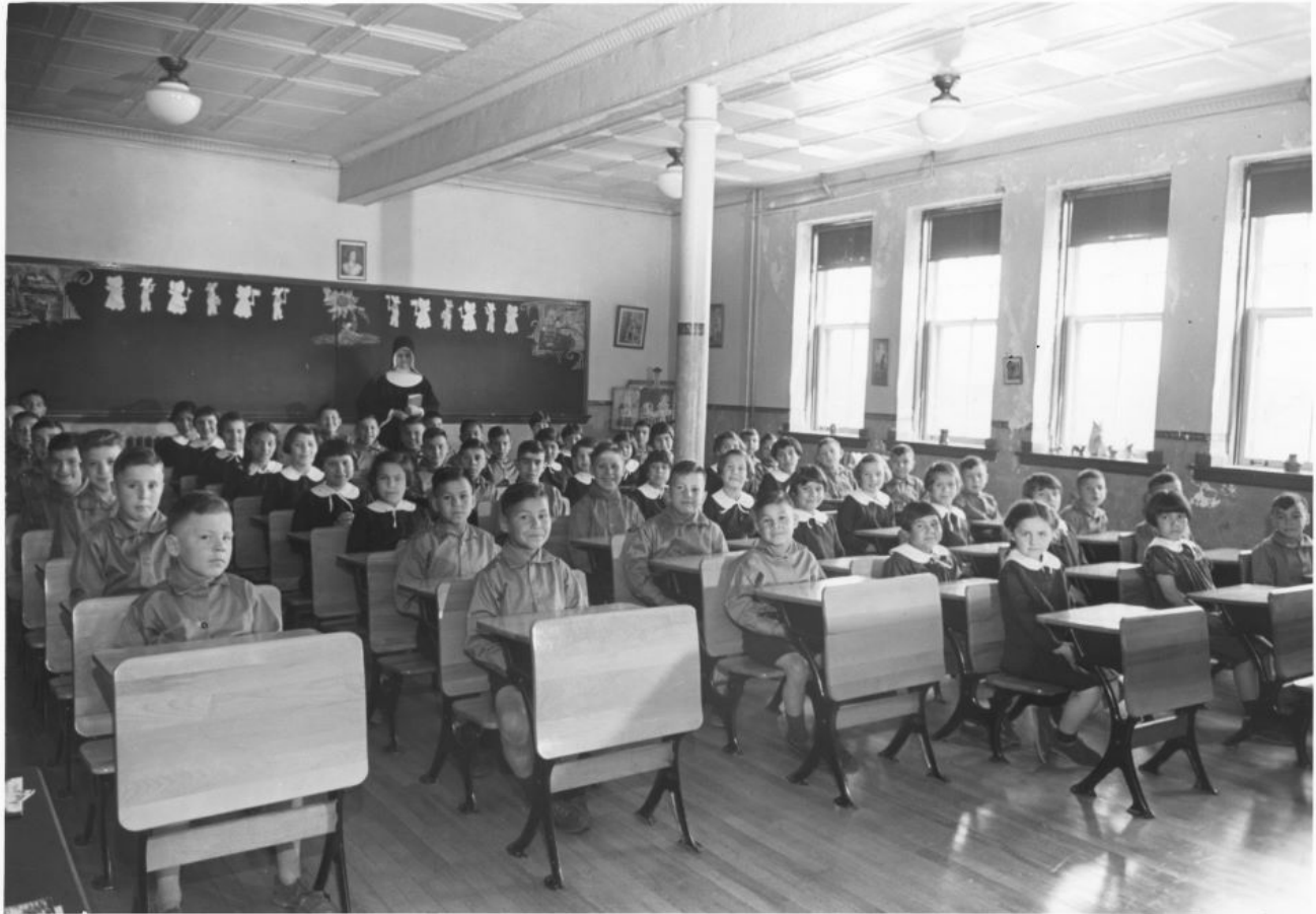
A nun stands at the back of a classroom at the Shubenacadie Residential School in this 1930s photo. The school operated 1929 to 1967.