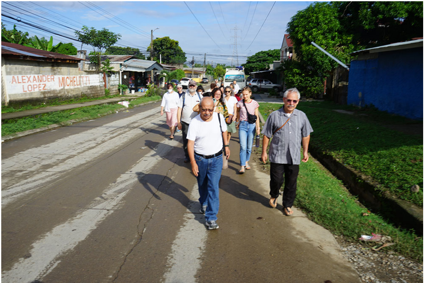
Members of the delegation walk to church for Mass on Dec. 11, 2022.

Blessed are they who suffer persecution for justice's sake, for theirs is the kingdom of heaven.