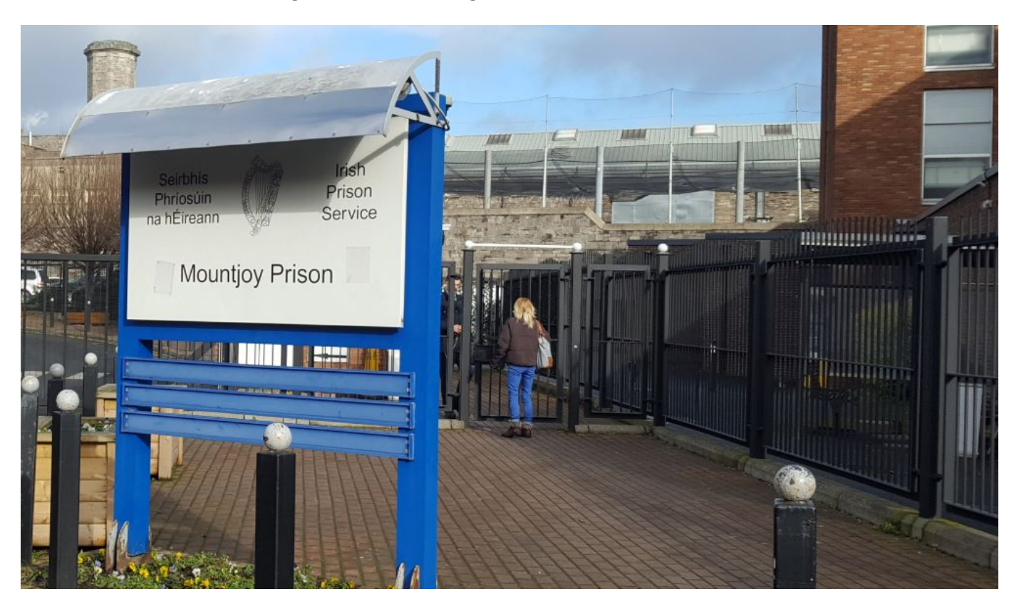
The North Circular Road entrance to Mountjoy Prison in Dublin

"Sometimes, I just listen to them. They like to have a one-to-one," she said. "Their stories can be very sad. I see my role as that of a faithful companion. It means a lot to the women and men that you sit and listen to them and see them as normal human beings — that you don't look down on them. They have slipped because of circumstances... There go I but for the grace of God."