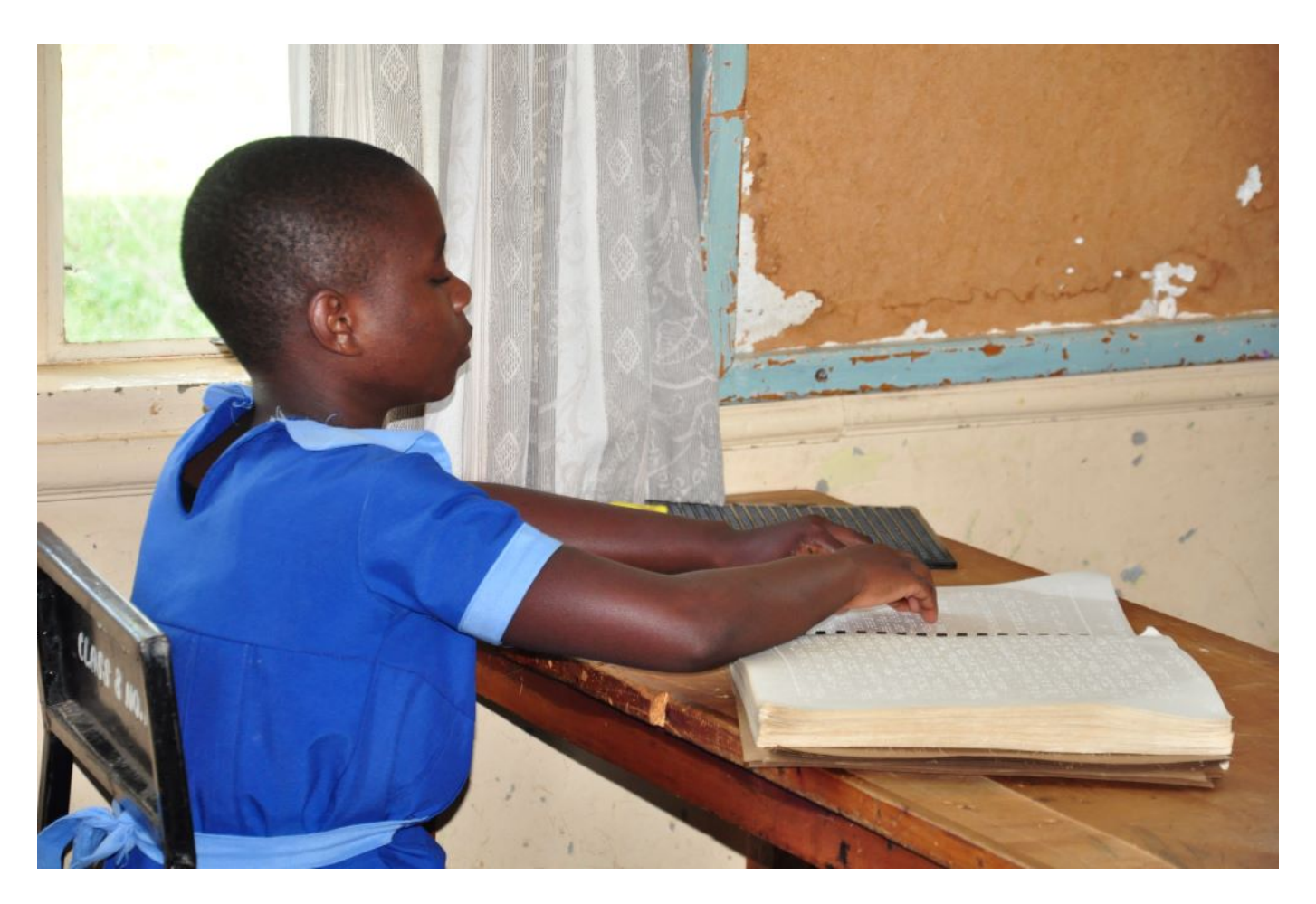
A girl reads Braille at St. Oda School for the Visually Impaired.