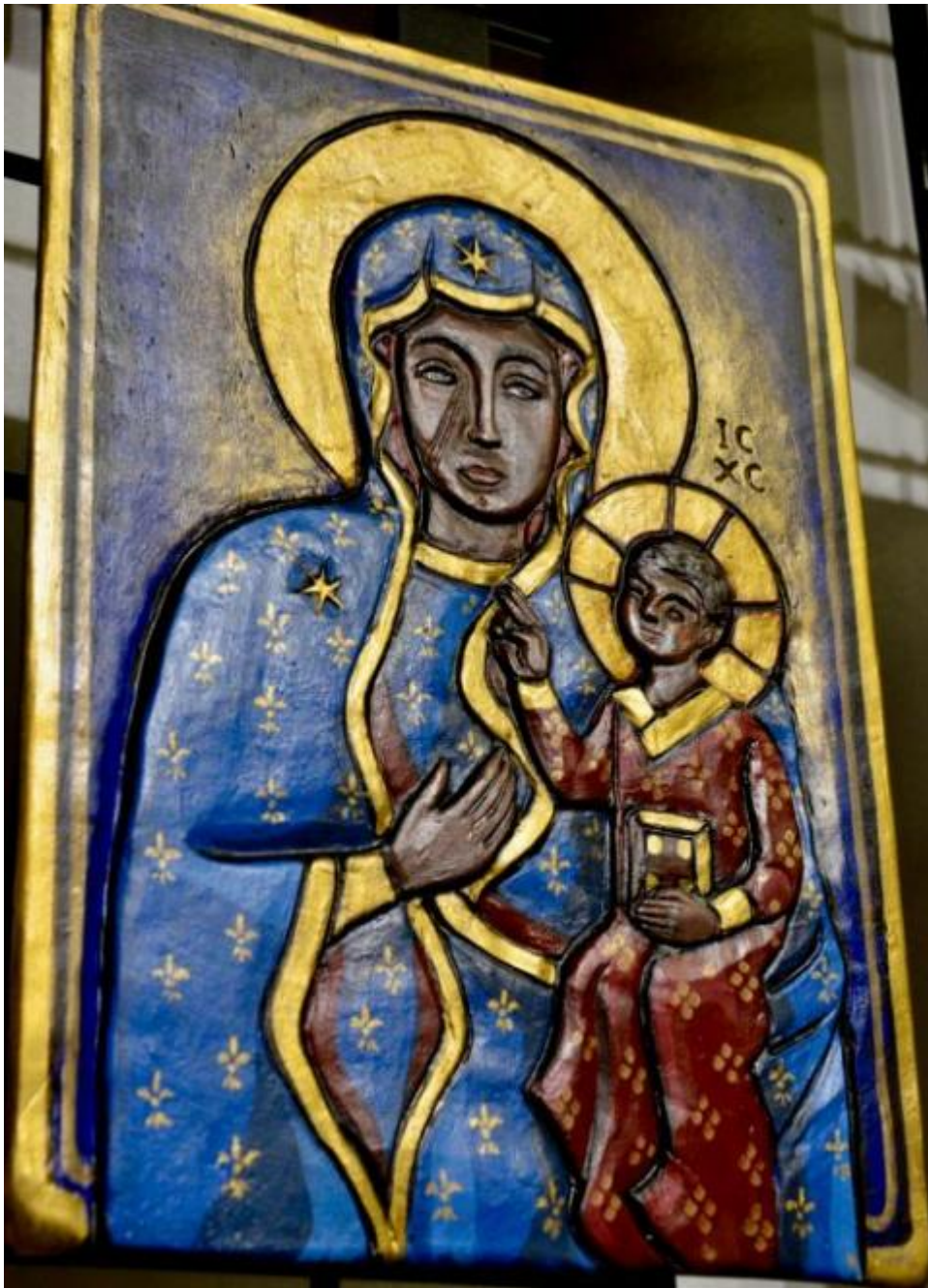
A handmade, hand-painted ceramic tile of the Madonna and child in the Sylvania Franciscans' gift shop in Sylvania, Ohio.