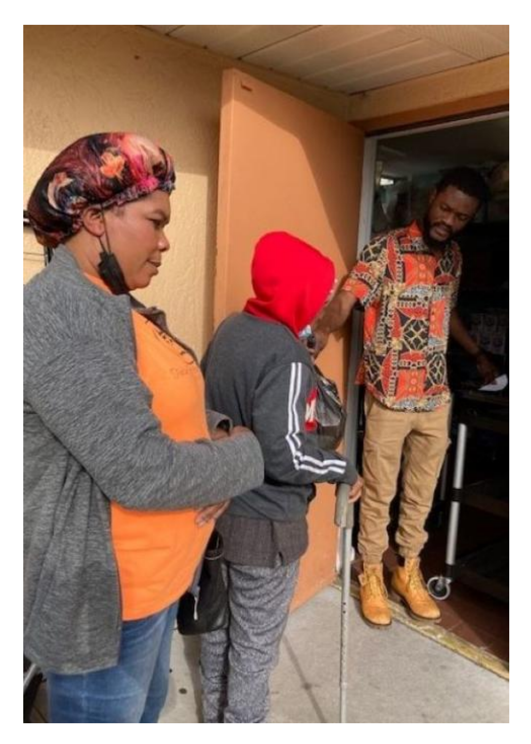
Haitian women pick up food at Catholic Charities in Immokalee, Florida.

Immigrants and refugees are Advent people. They know what it means to wait. In September 2021, thousands of Haitian migrants <u>arrived</u> in Del Rio, Texas. They came from Chile and Brazil to seek a better life from the poverty and instability in Haiti. They looked forward expectantly to a better life.