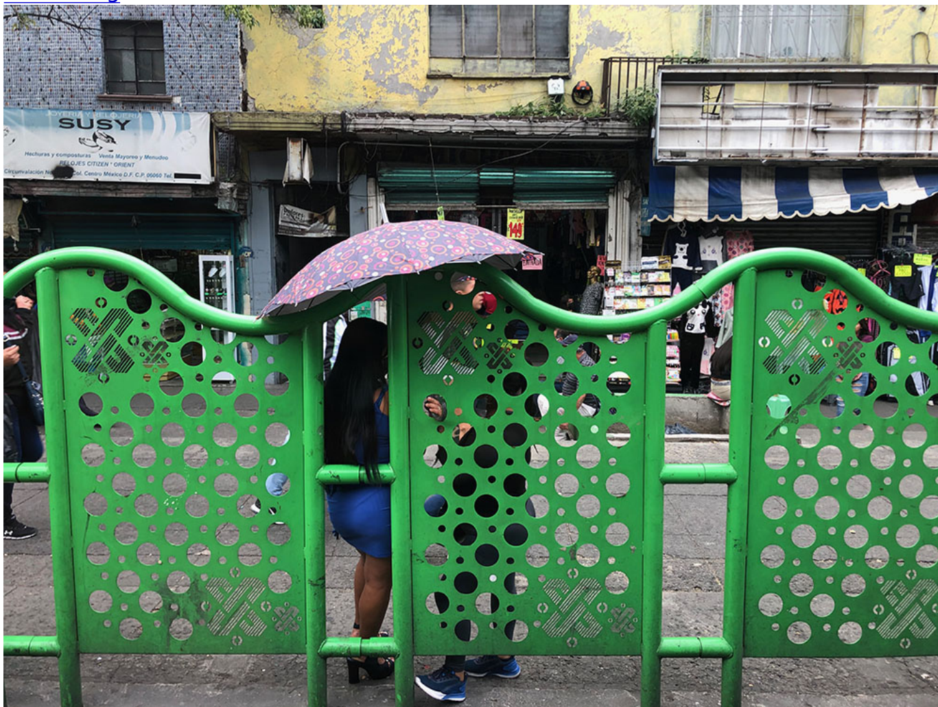
Sex workers in their skin-tight dresses and high heels leaning on the green sidewalk barriers are a common sight along Circunvalación, one of the main thoroughfares through La Merced.