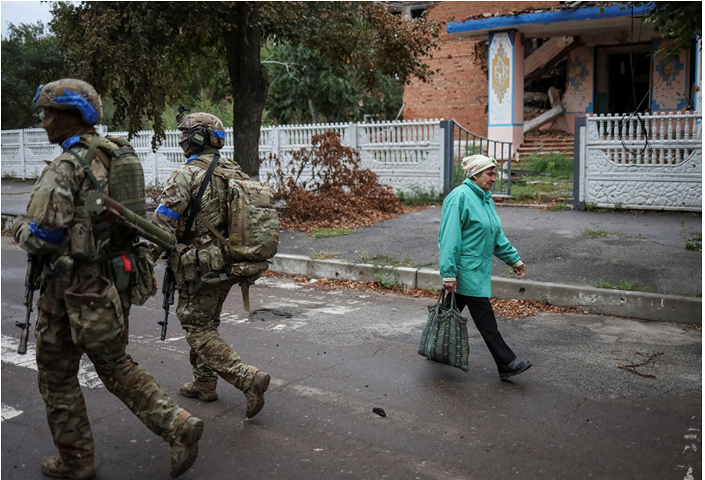
A woman passes Ukrainian servicemen patrolling an area Sept. 14 in Iziom.

Add the war in Ukraine, and "it's compounding crises, one after another, and the resilience of the people is eroded, basically. They cannot cope anymore. I mean, you are a family, a woman farming in the dry corridor of Honduras, and you got the [2020] Eta hurricane," she said. "On top, you got COVID-19, where you couldn't plant or couldn't move your harvest. And then you get that everything you buy is double in price."