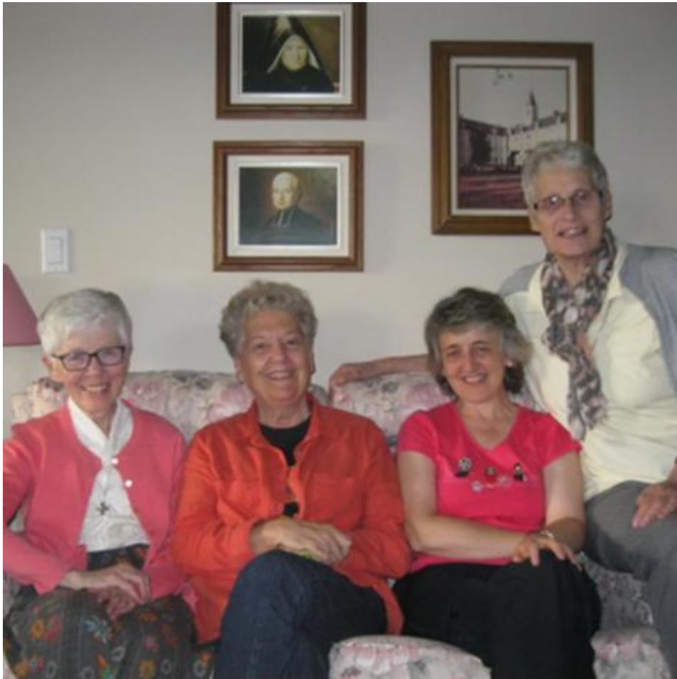
Members of the St. Kateri local community of Ursulines of Jesus

happiness of others and spread this love around them, even to the poorest, in silent or even hidden gestures. This is what so many religious men and women do throughout the world, although they certainly are not the only ones.