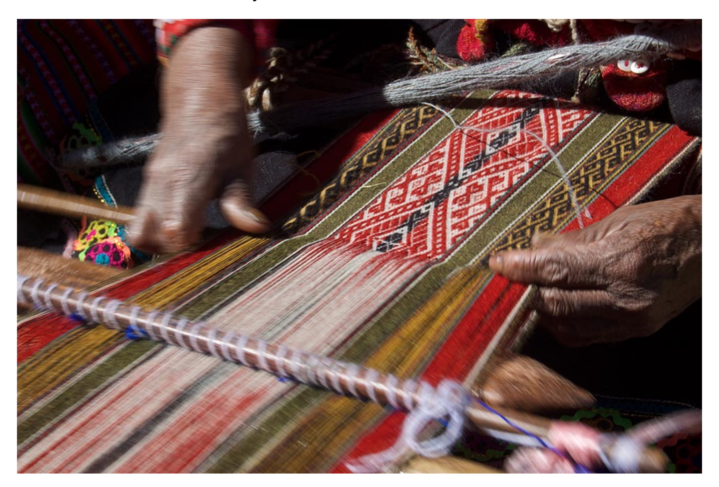
A Quechua woman near Cuzco, Peru, weaves llama yarn.

My mom volunteered in a number of church or school organizations. There was a sense of being involved in what was for the common good that took priority in her life — and in that of our family.