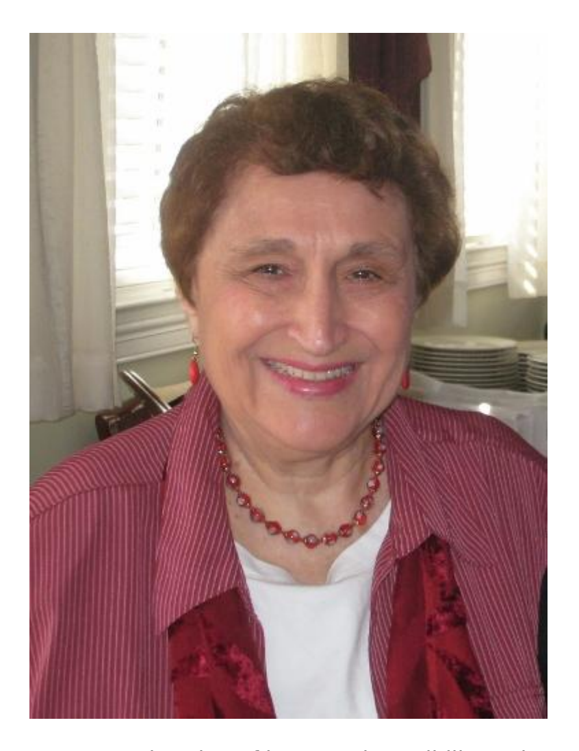
"It was such a day of hope and possibility," she said.