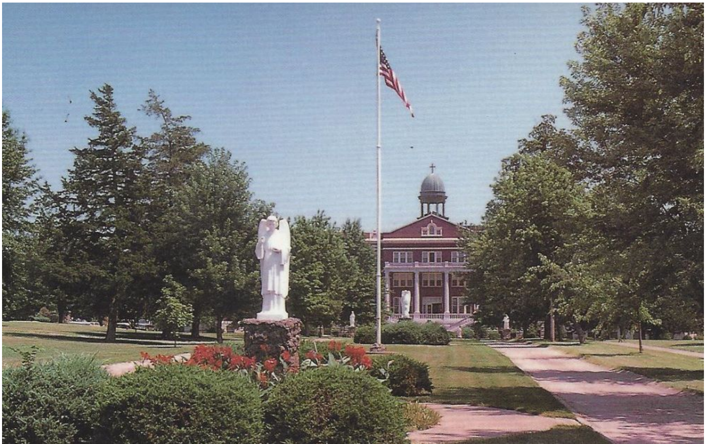
The campus of the Ursuline Sisters of Paola, Kansas, in an undated photo

Updating the motherhouse cost millions: It needed a sprinkler system, new flooring, paint, and extensive remodeling to meet its new use, the Republic reported.