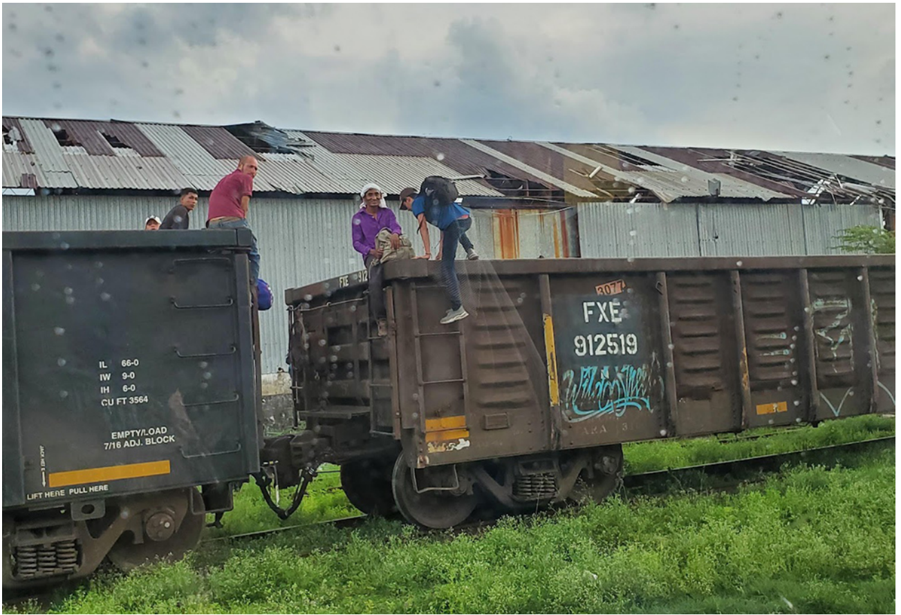
Migrants hop on a train at Coatzacoalcos, Mexico.