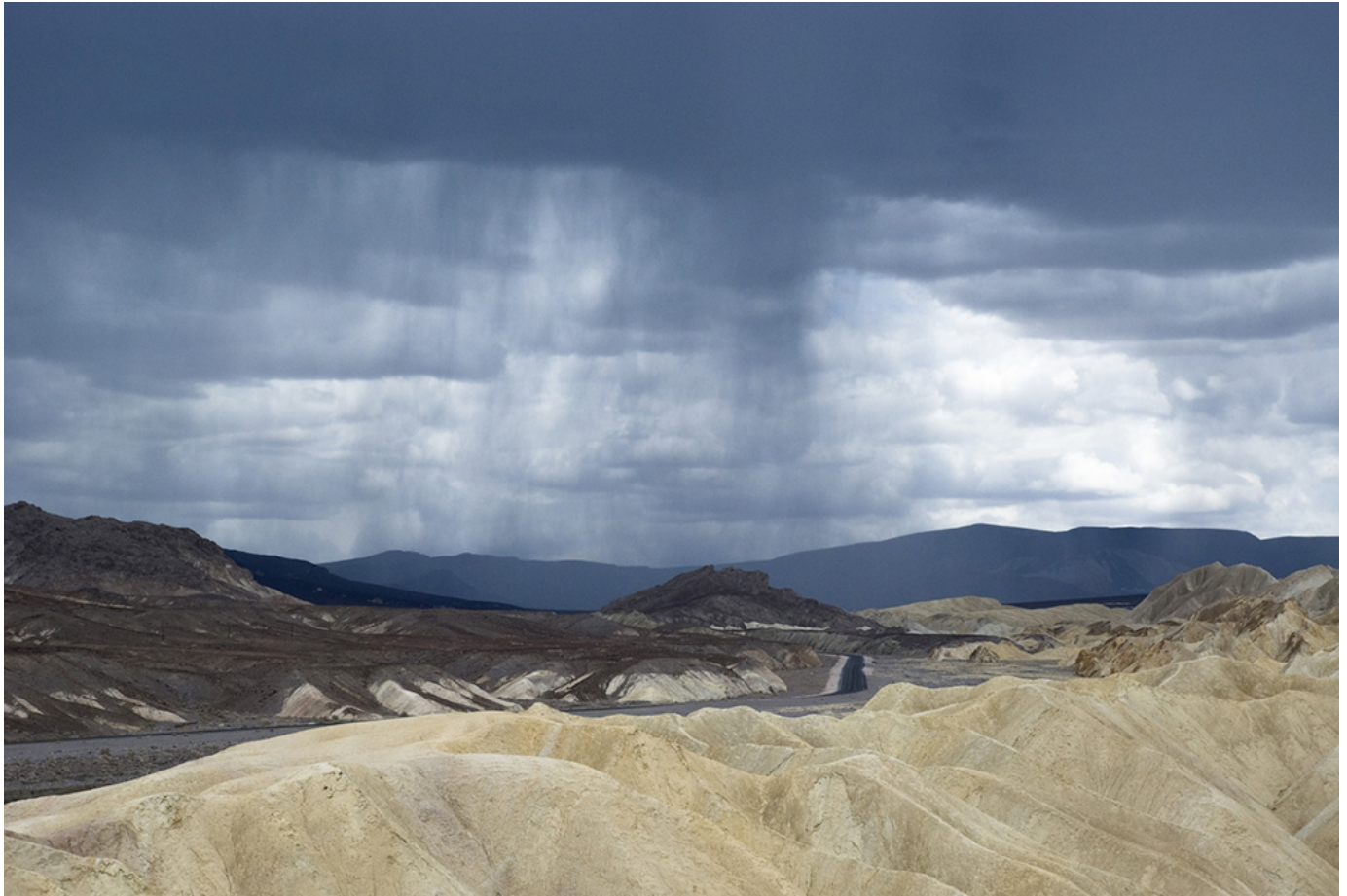
Rain clouds are seen over the landscape in Death Valley National Park, California

Another was reconciliation with my deeper self, a letting-go of old images and old stories and reconciling them with the deeper ones I discovered that lived within me. When we do this work, we create new worlds for ourselves.