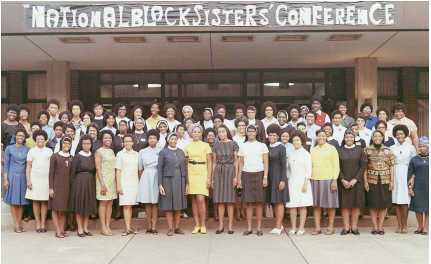
Early members of the National Black Sisters' Conference outside the conference headquarters in Pittsburgh in the early 1970s.