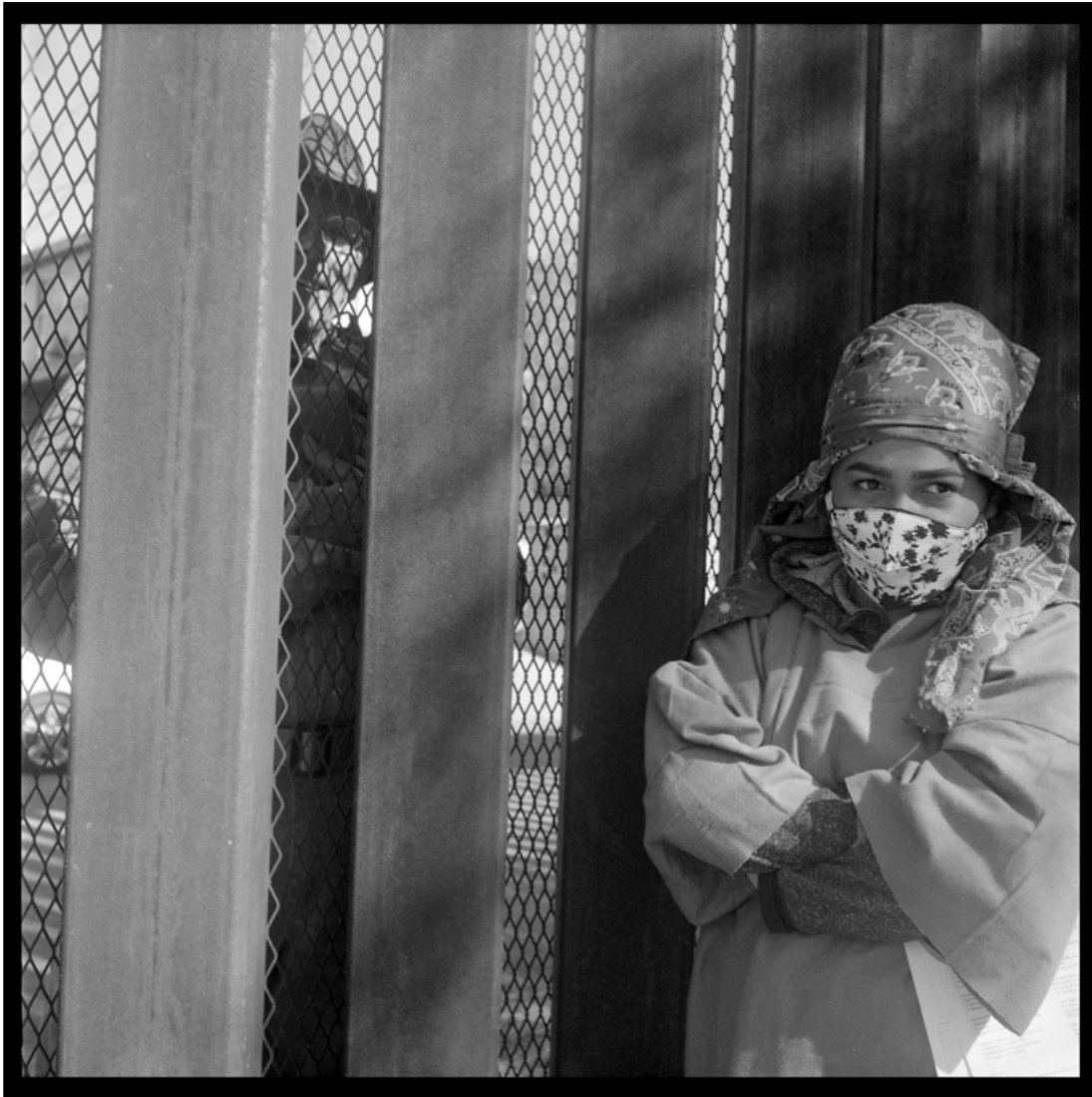
A woman on the Mexican side and a man on the American side meet at the fence to talk during the Las Posadas observation in December 2021. In addition to the religious gathering, migrants walked along the border wall singing songs in protest of Title 42 and the Migration Protection Protocols. (Lisa Elmaleh)