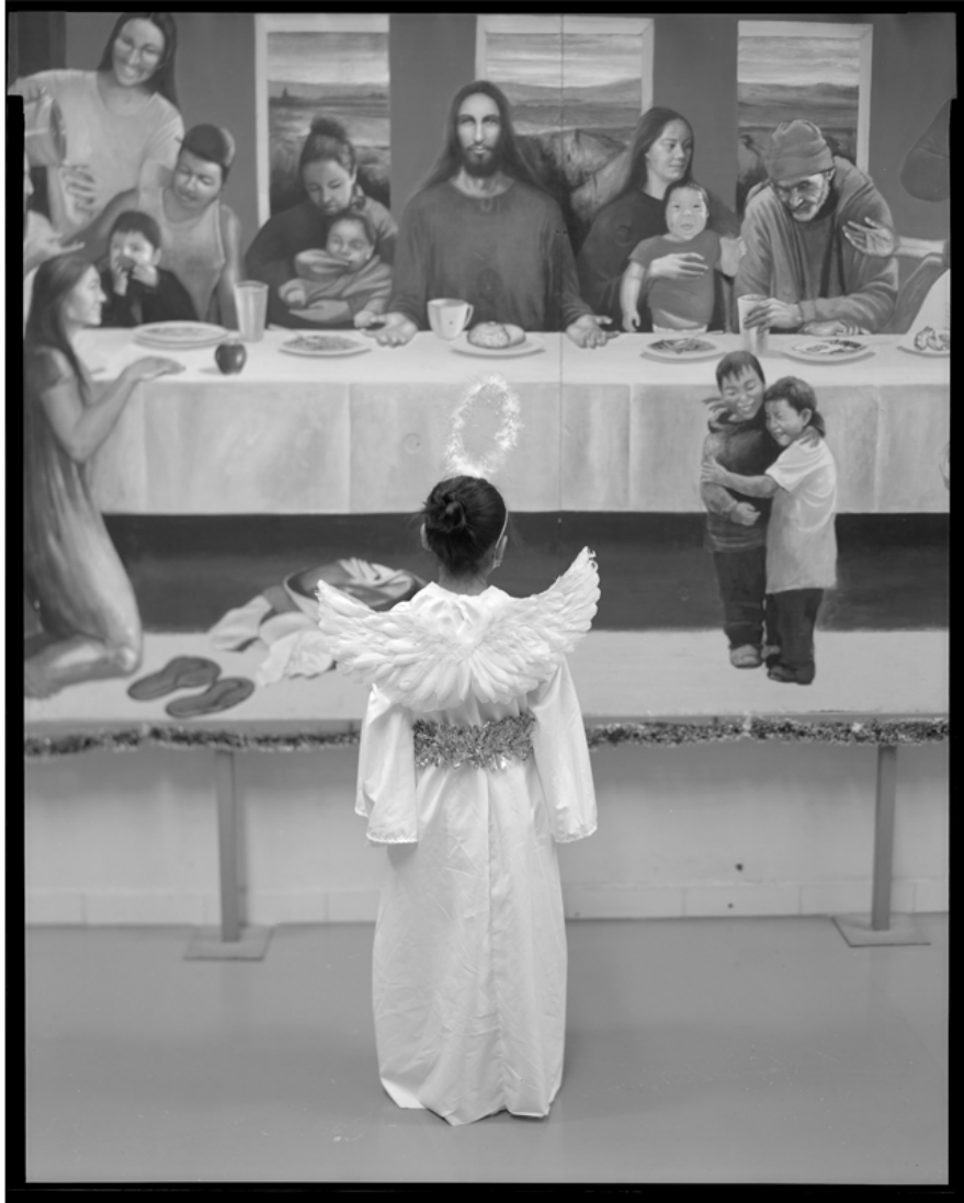
A child is dressed as an angel for Las Posadas (The Inns), a religious festival celebrated in Mexico and various Latin America countries. Families dress as Joseph and Mary to reenact the Holy Family's journey from Nazareth to Bethlehem in search of a safe place to give birth to Jesus. The child dressed as an angel stands in front of the Last Supper mural at the Kino Border Initiative, less than half a mile from the Mariposa border crossing.