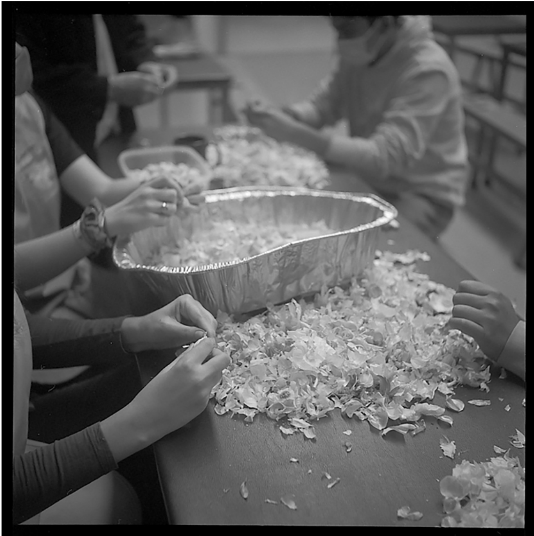
Volunteers and migrants peel garlic for the kitchen at the Kino Border Initiative in Nogales, Mexico.