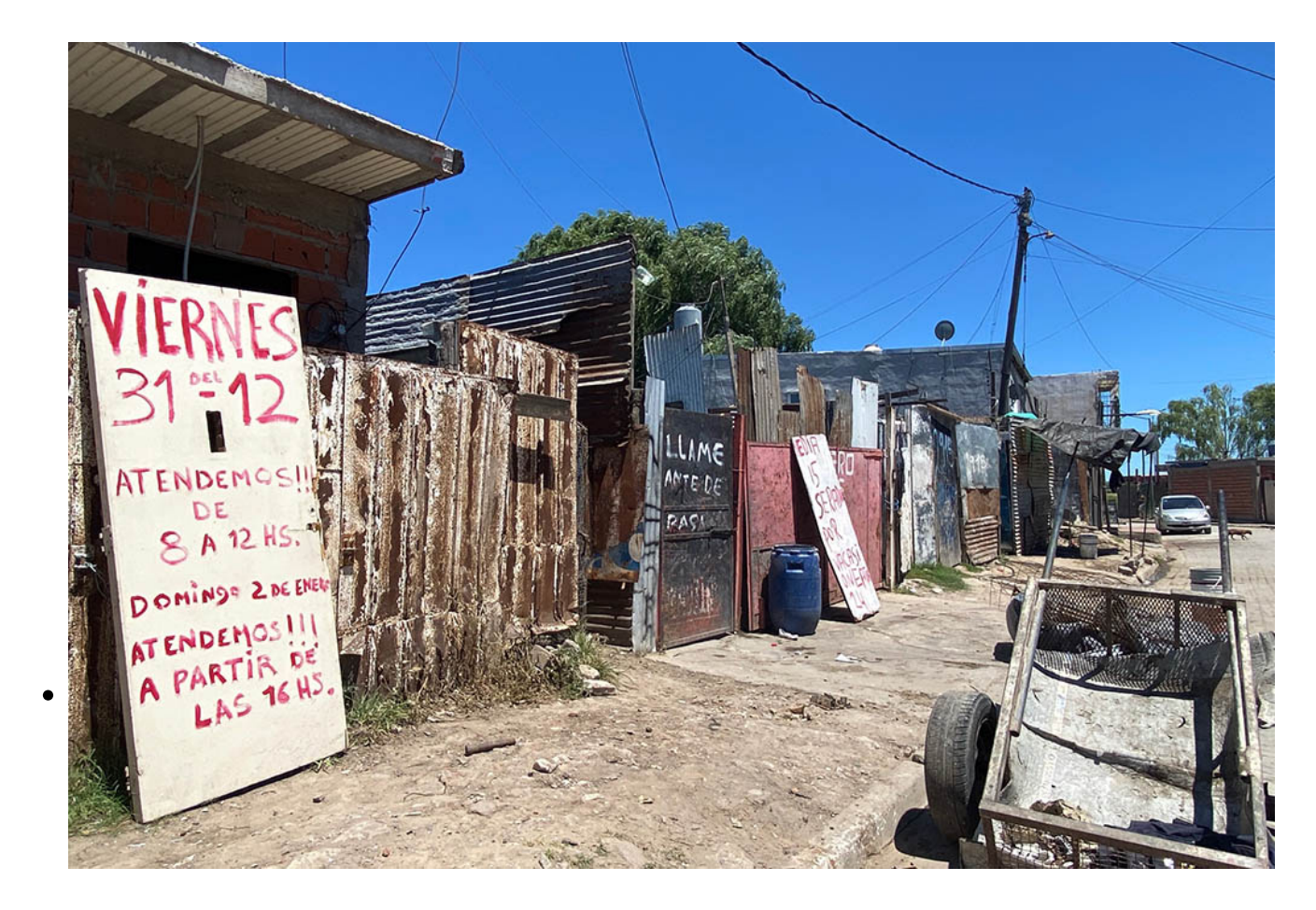
A street in Villa Hidalgo.

One of Project Dignity's increasingly popular resources is Susana Orlandi, a clinical psychologist with experience working in prisons. The sisters recruited her to make weekly trips to the villa, where she hosts individual 30-minute sessions pro bono in the chapel's backroom.