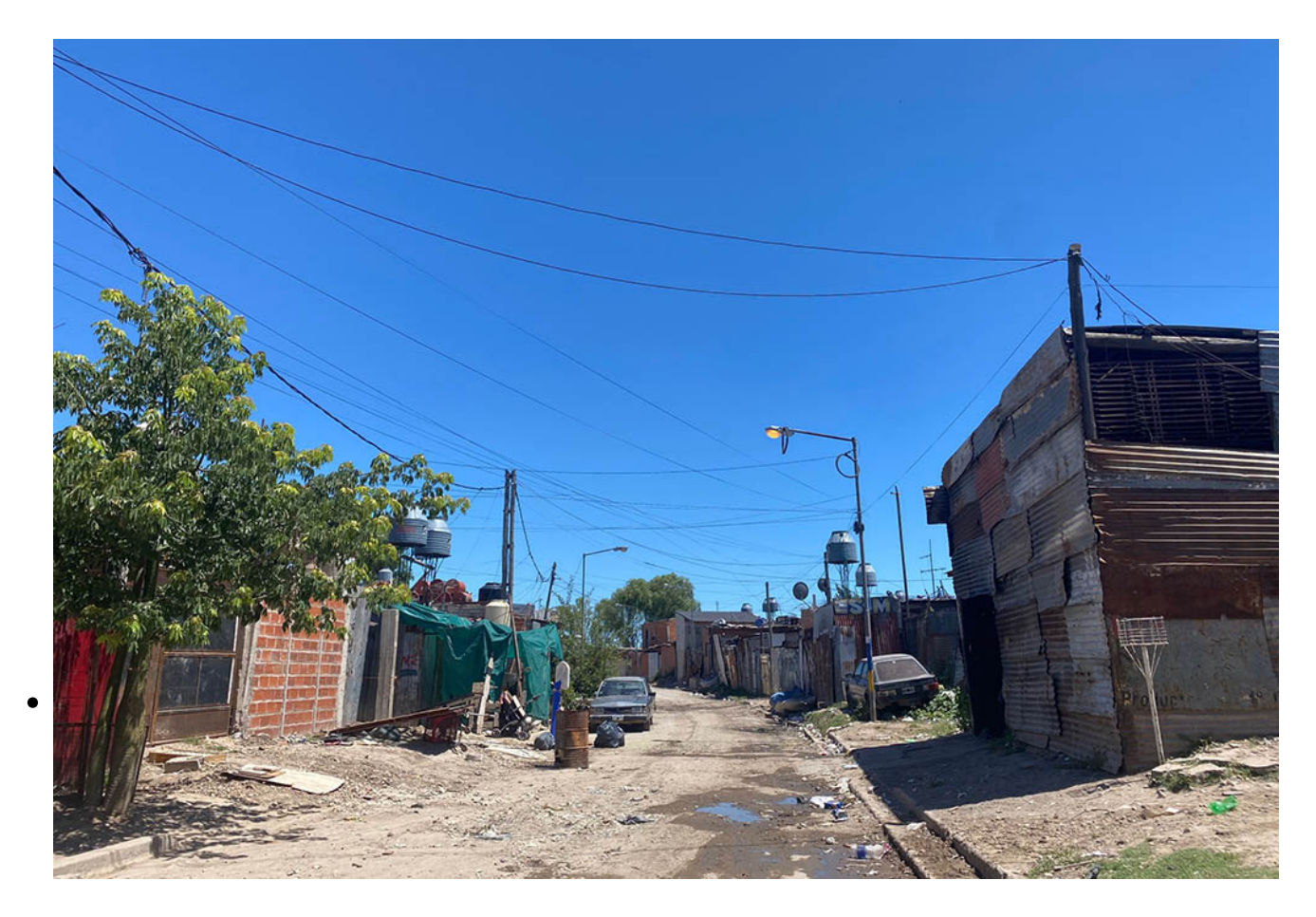
One of the main roads running through Villa Hidalgo, Buenos Aires, Argentina.