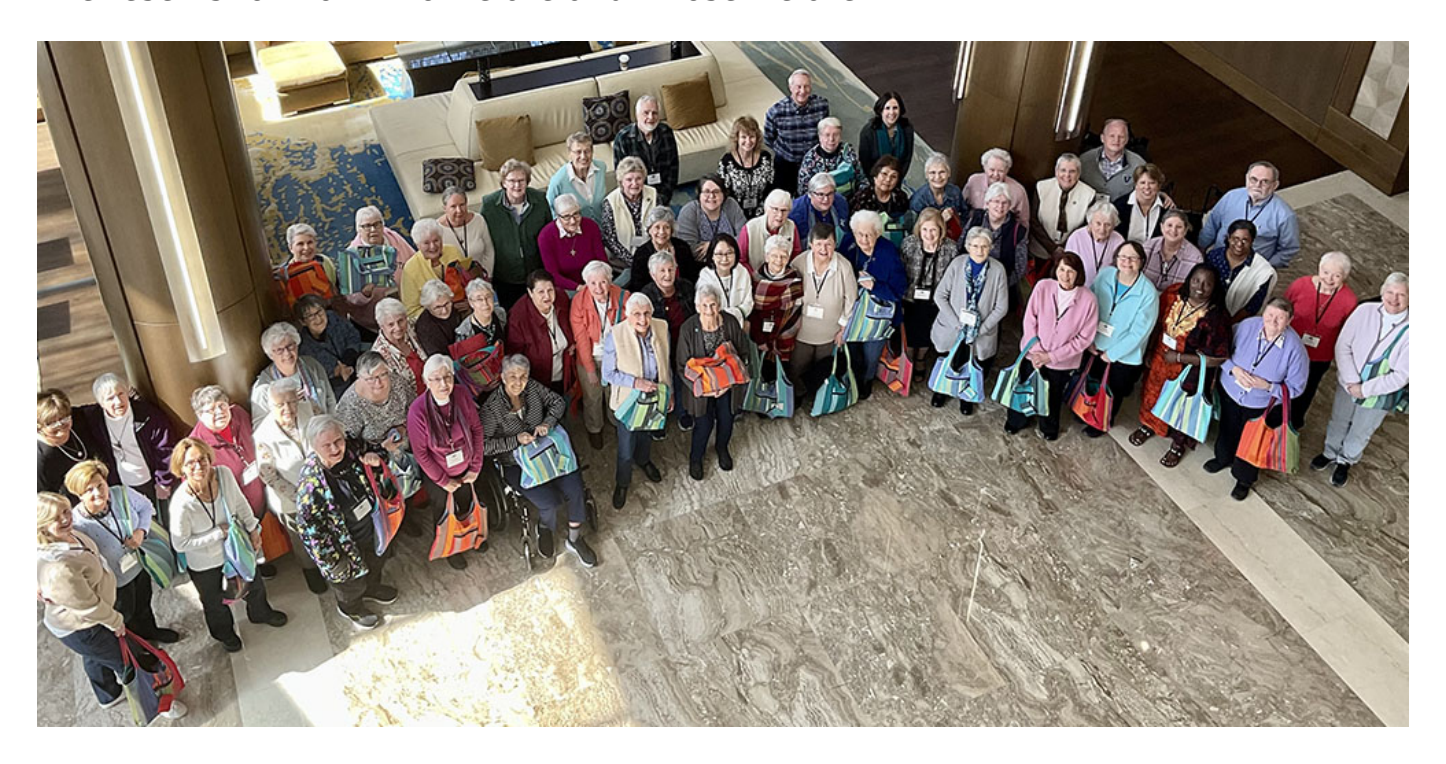
The Sisters of Saint Joseph of Peace at their 2022 chapter

The reset is to know who we are and whose we are.