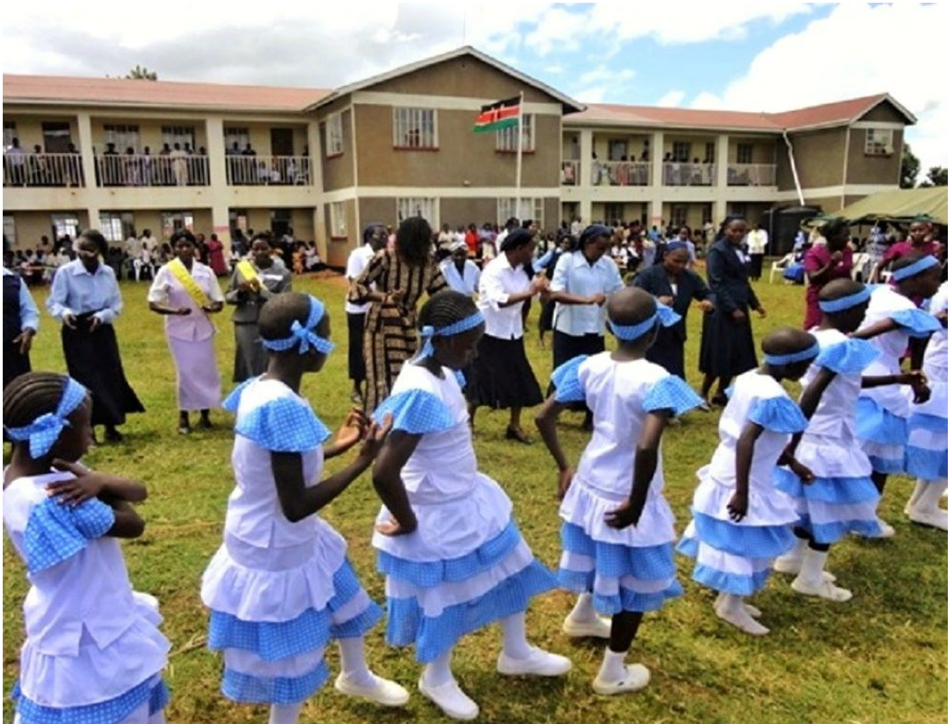
Girls participate in a 2014 graduation ceremony at St. Ursula's Primary School in Kitale. Education, particularly for girls, has been a primary ministry for Ursuline sisters in Ireland and Kenya.