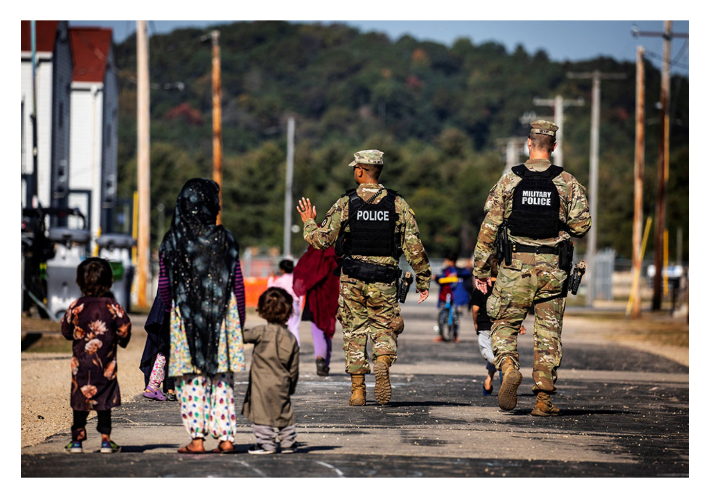
U.S. Military Police walk past Afghan refugees at Fort McCoy U.S. Army base in Wisconsin Sept. 30.