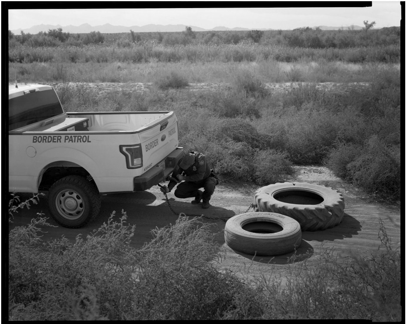
A Border Patrol agent in Texas drags tires behind his truck in June 2020 to smooth the dirt road in a stretch of land with no wall so footprints are more visible. Drug traffickers, which he says are common in that area because of a nearby interstate, were of particular interest to him. He did not mention migrants as part of his search.